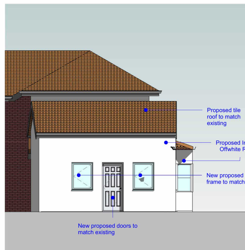
Proposed South East Elevation Scale - 1 : 100