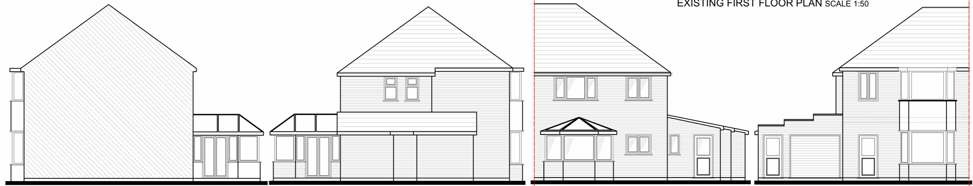
EXISTING RIGHT SIDE ELEVATION SCALE 1:100