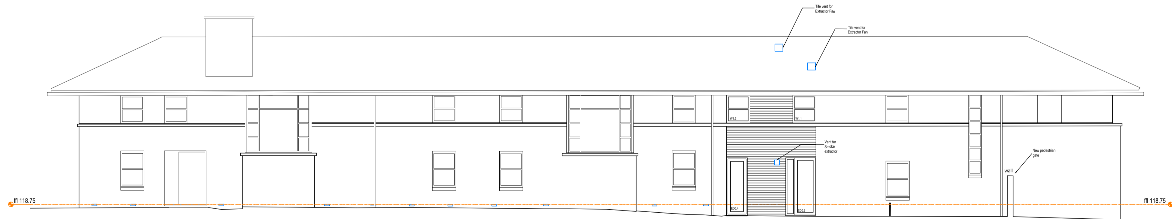
ELEVATION C Datum 115.00m