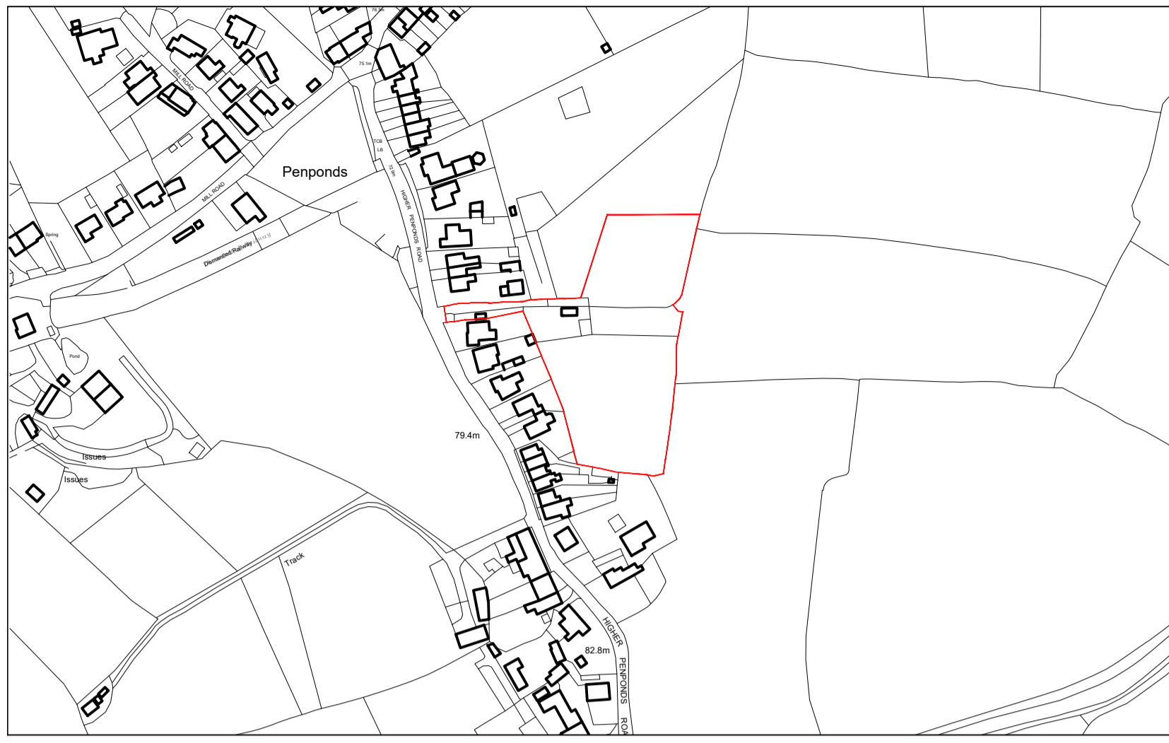
01 | LOCATION PLAN SCALE 1:2500