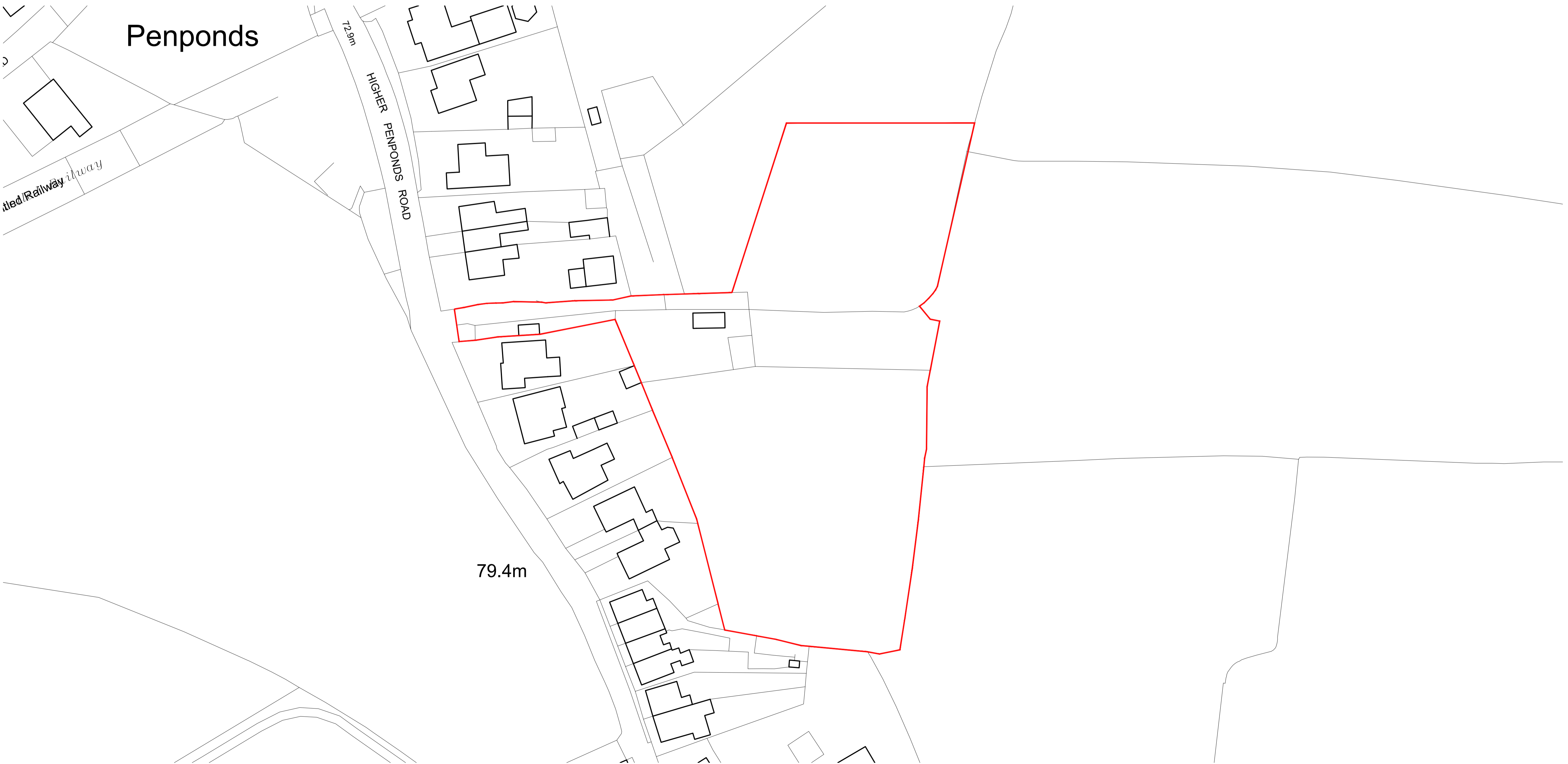
02 | BLOCK PLAN SCALE 1:500