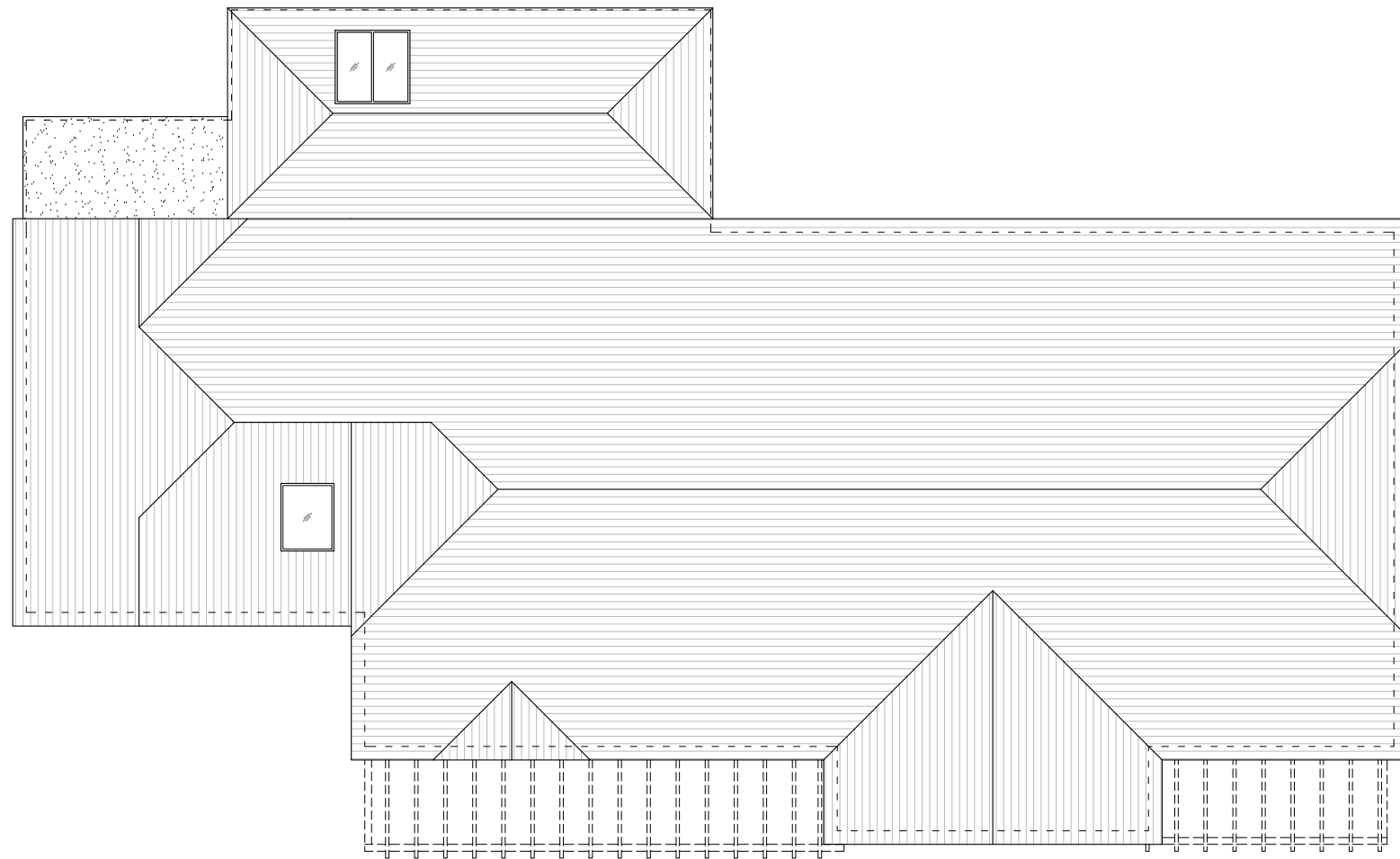
Roof Plan As Proposed