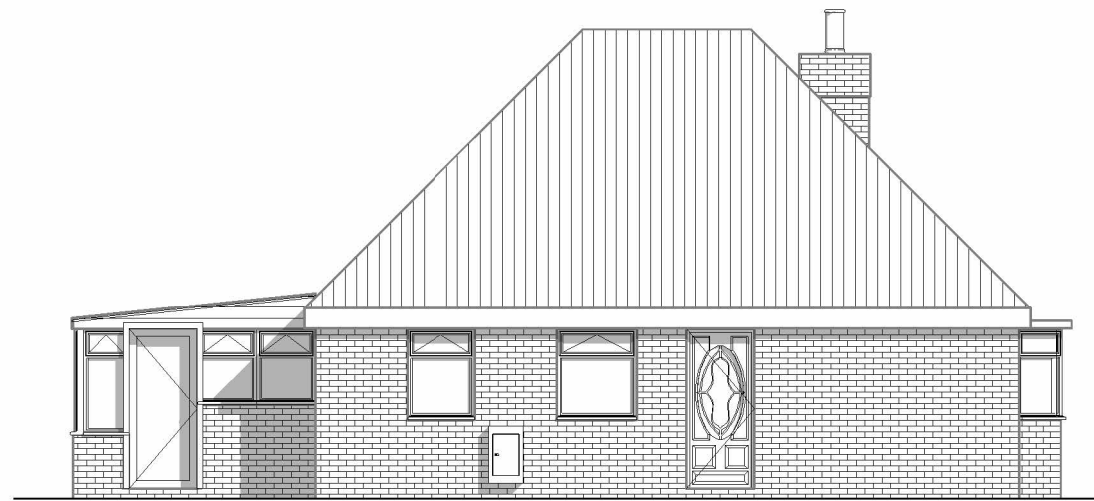
3 Existing Side B 1 : 100