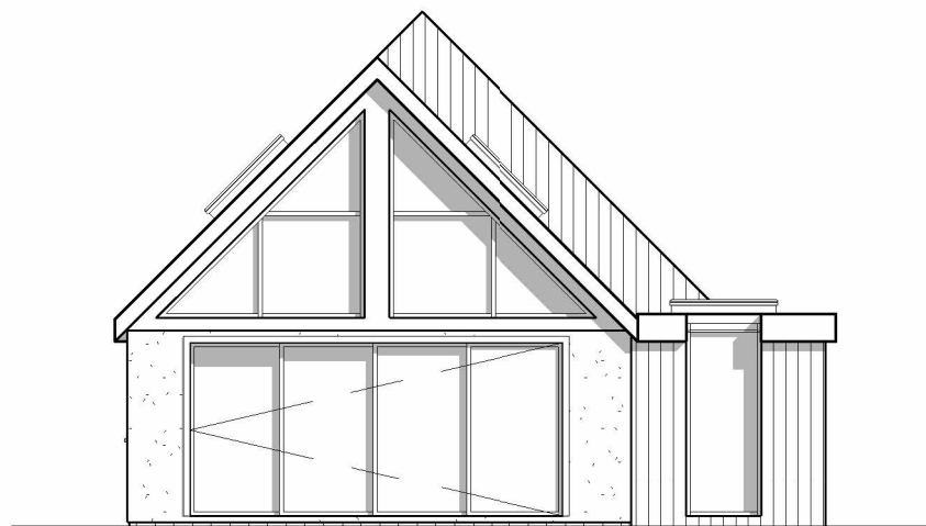
2 Proposed Rear 1 : 100