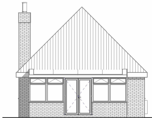
1 Existing Rear 1 : 100

Any Alterations to these drawings should be checked for compliance with Planning and Building Control. It is the responsibility of the client to check that the plans do not contravene or affect covenants or encroach boundaries, and matters relating to land Title. Also that issues relating to the party wall act are implemented at the relevant stages.