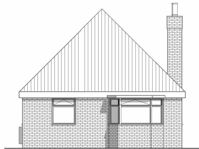
1 Existing Front 1 : 100

© Terms & Conditions No copies without approval, copyright remains the property of Calculate My Beam. Drawings must not be used for quotations until the relevant approvals have been granted and checked on site by client and principle contractor. Any discrepancies to sizes or relevant details which may affect quotations and or building costs/procedures must be reported to Calculate My Beam and the drawings must be amended prior to any commencement of said quotations and building works. Starting work before approval of plans by Building Control is at the customers own risk. It is the responsibility of the contractor/builder to check all sizes on site prior to and during the build. It is the responsibility of the Client and principle contractor/builder to conform to both Building regulations and CDM 2015 regulations. When existing trees are to be retained they should be subject to a full Arboricultural Survey/inspection for safety. All trees are to be planted to ensure they are a minimum of 5m from buildings and 3m from drainage and services. A suitable method of foundation is to be provided to accommodate the proposed tree planting. Any Alterations to these drawings should be checked for compliance with Planning and Building Control. It is the responsibility of the client to check that the plans do not contravene or affect covenants or encroach boundaries, and matters relating to land Title. Also that issues relating to the party wall act are implemented at the relevant stages.