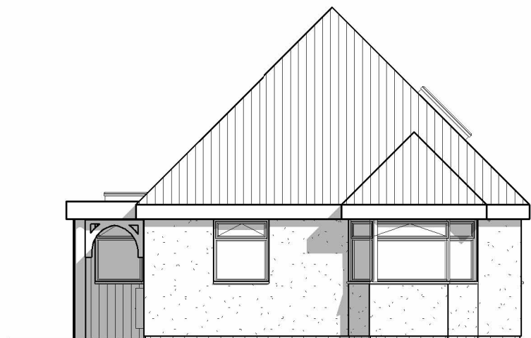
2 Proposed Front 1 : 100