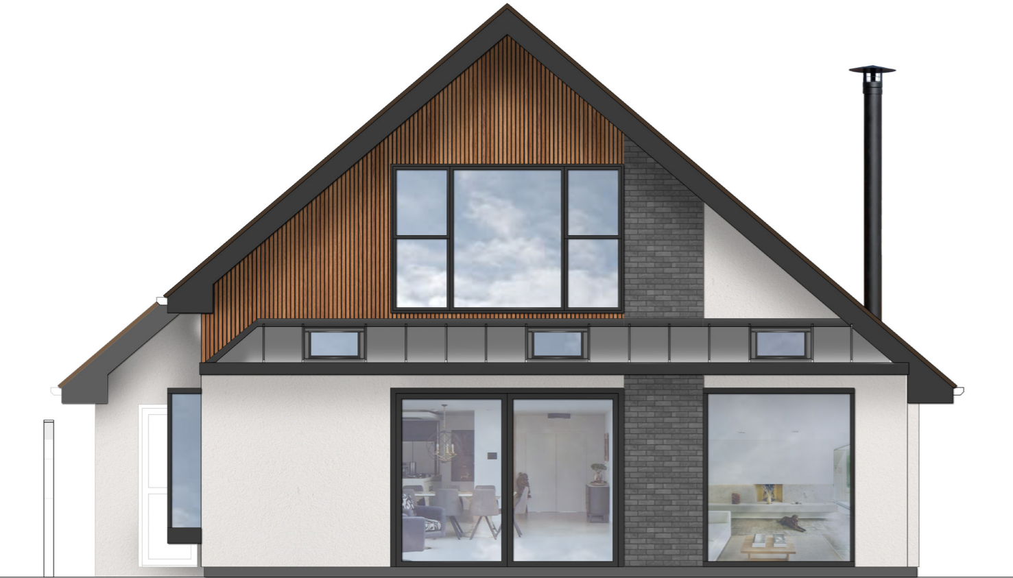
PROPOSED NORTH-WEST ELEVATION_NTS