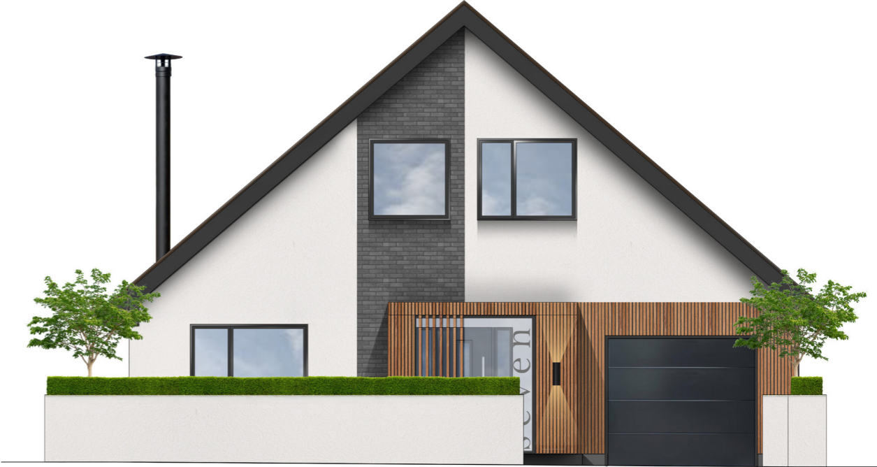
PROPOSED SOUTH-EAST ELEVATION WITH BOUNDARY_NTS