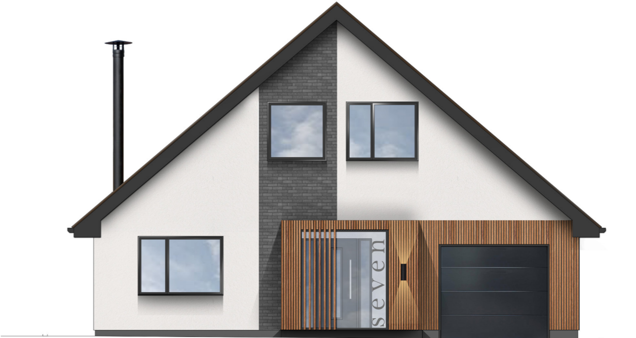
PROPOSED SOUTH-EAST ELEVATION_NTS