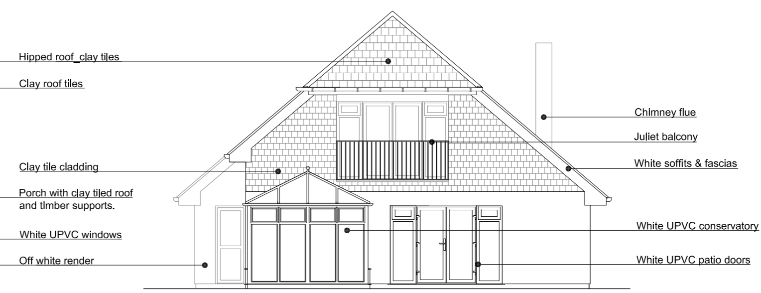
Existing North-West Elevation Scale 1:100 @ A2