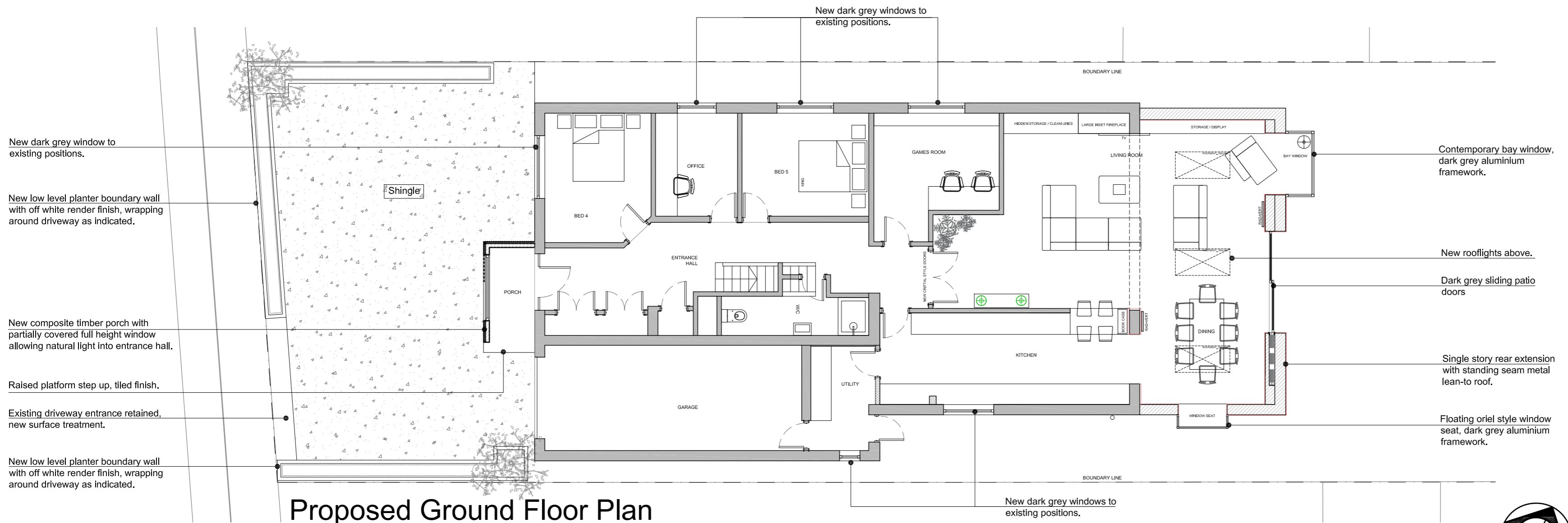
Proposed Ground Floor Plan Scale 1:100 @ A2

STUDIOeed + 4 4 7 5 2 5 0 8 8 1 3 9 www.studioeed.co.uk emma@studioeed.co.uk