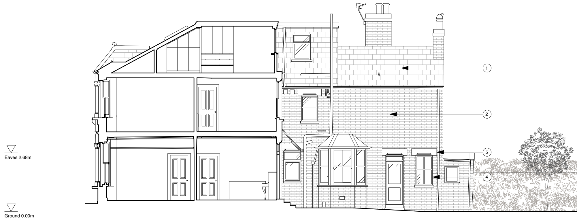
1 Existing Section 01 Scale: 1:100