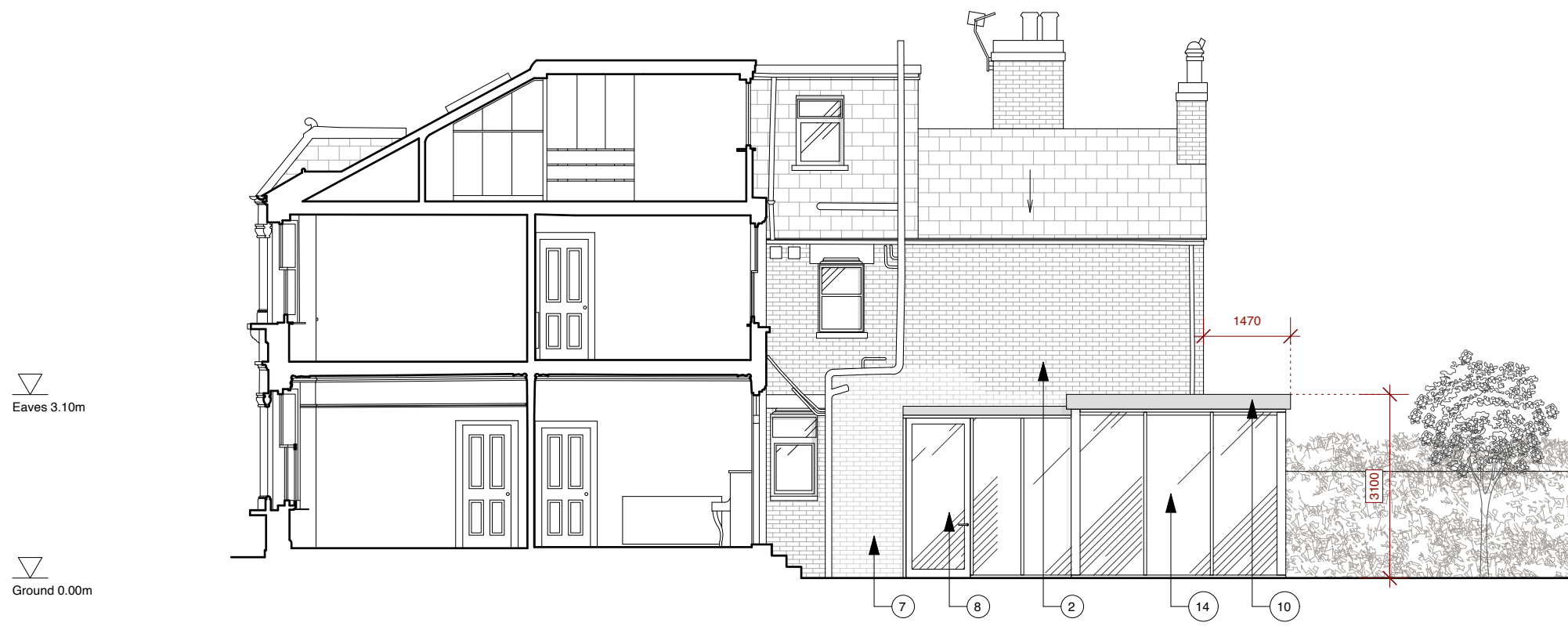
2 Proposed Section 01 Scale: 1:100