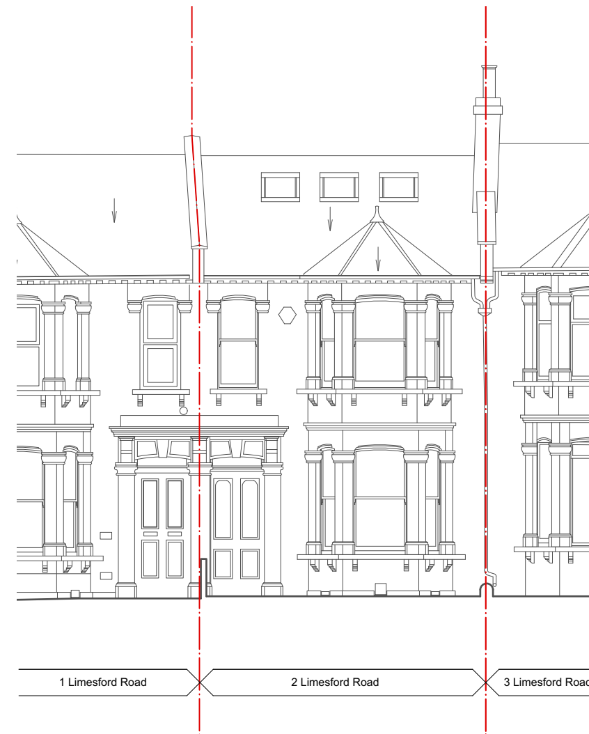
2 Proposed Front Elevation Scale: 1:100