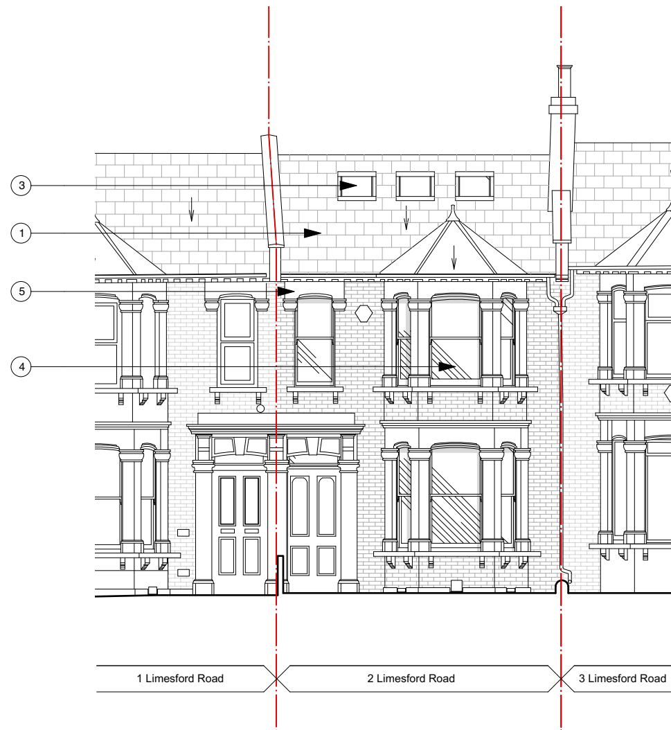
1 Existing Front Elevation Scale: 1:100