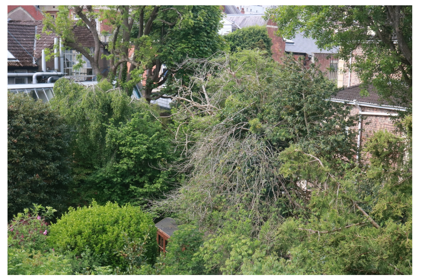
FROM A SUMMER VIEW from the house. Tree(s) based in South west end of #6 Garden on boundary to #4 College rd, showing considerable dead material among a lot of Ivy etc at height. (This is also close to the Worcester Crescent Boundary, but not as close as #4 which is overhung)