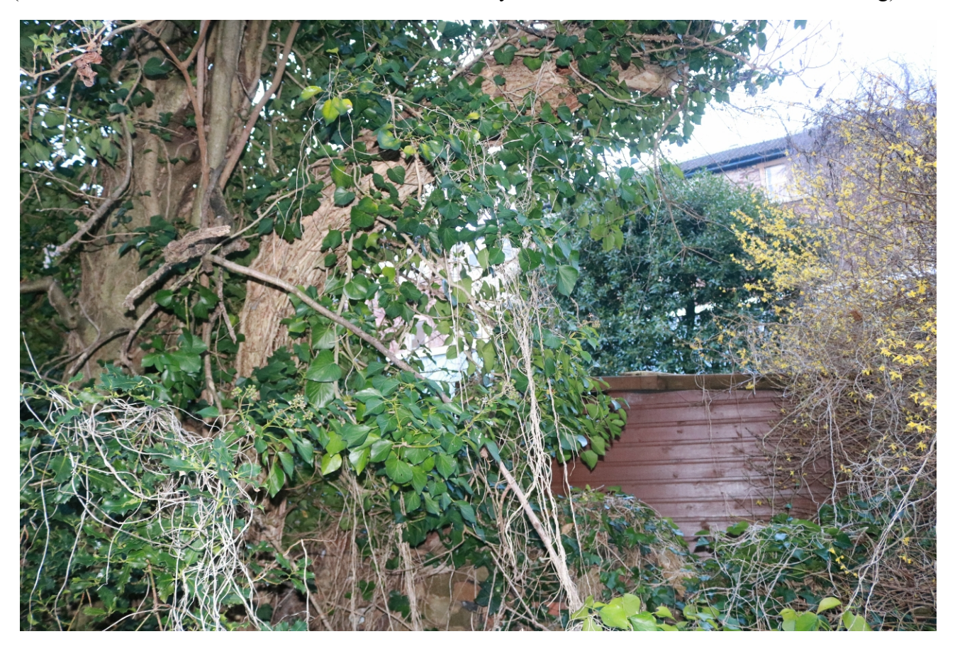
South West end of garden at ground level, March 2024. Right hand trunk stem direction in particular worrying (see also next frame). Shed is in adjacent property #4, to south. Green Foliage is Ivy and Holly.