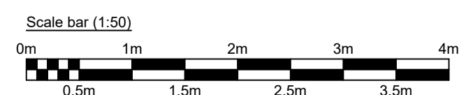
Existing Ground Floor Plan Scale 1:50 @ A1