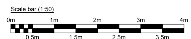
Proposed Ground Floor Plan Scale 1:50 @ A1