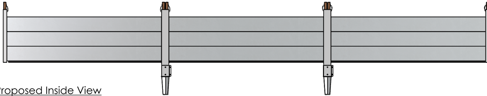
Proposed Inside View