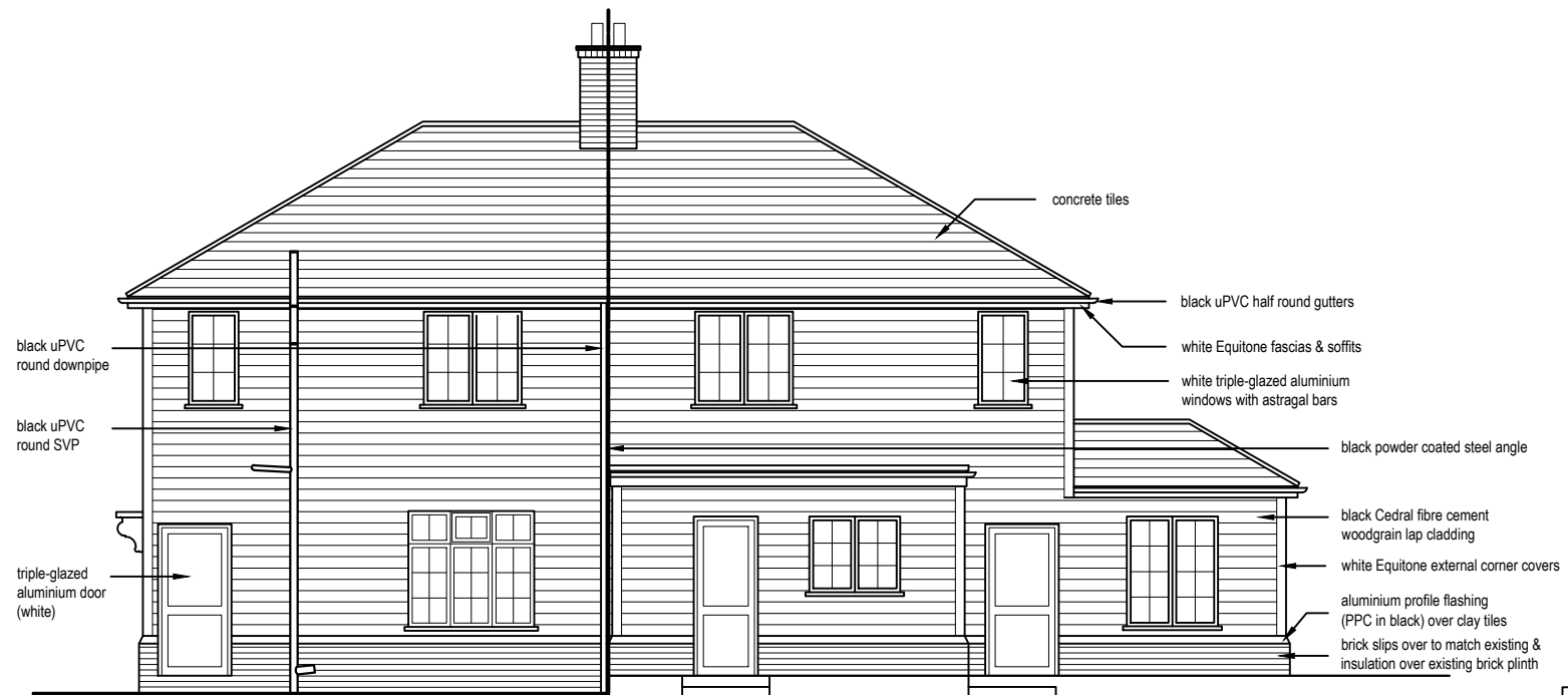
Proposed Rear Elevation (North East)