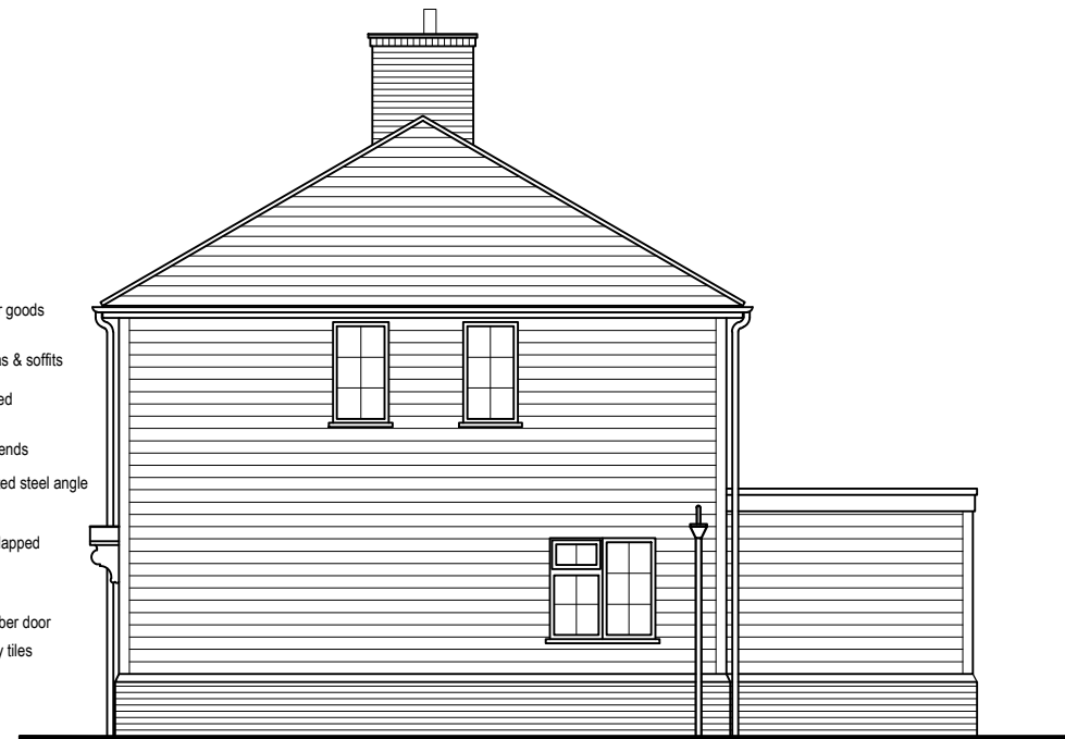
Existing Side Elevation (North West)