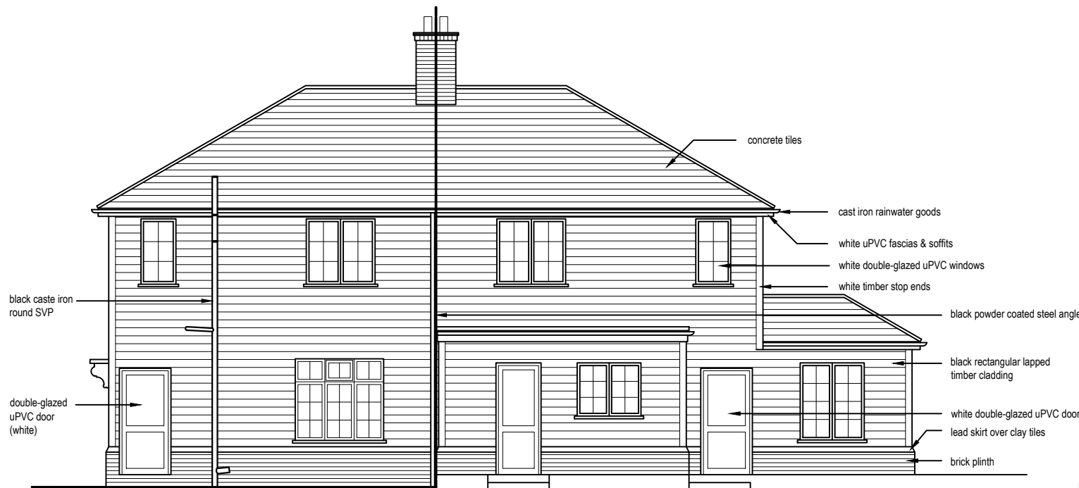
Existing Rear Elevation (North East)