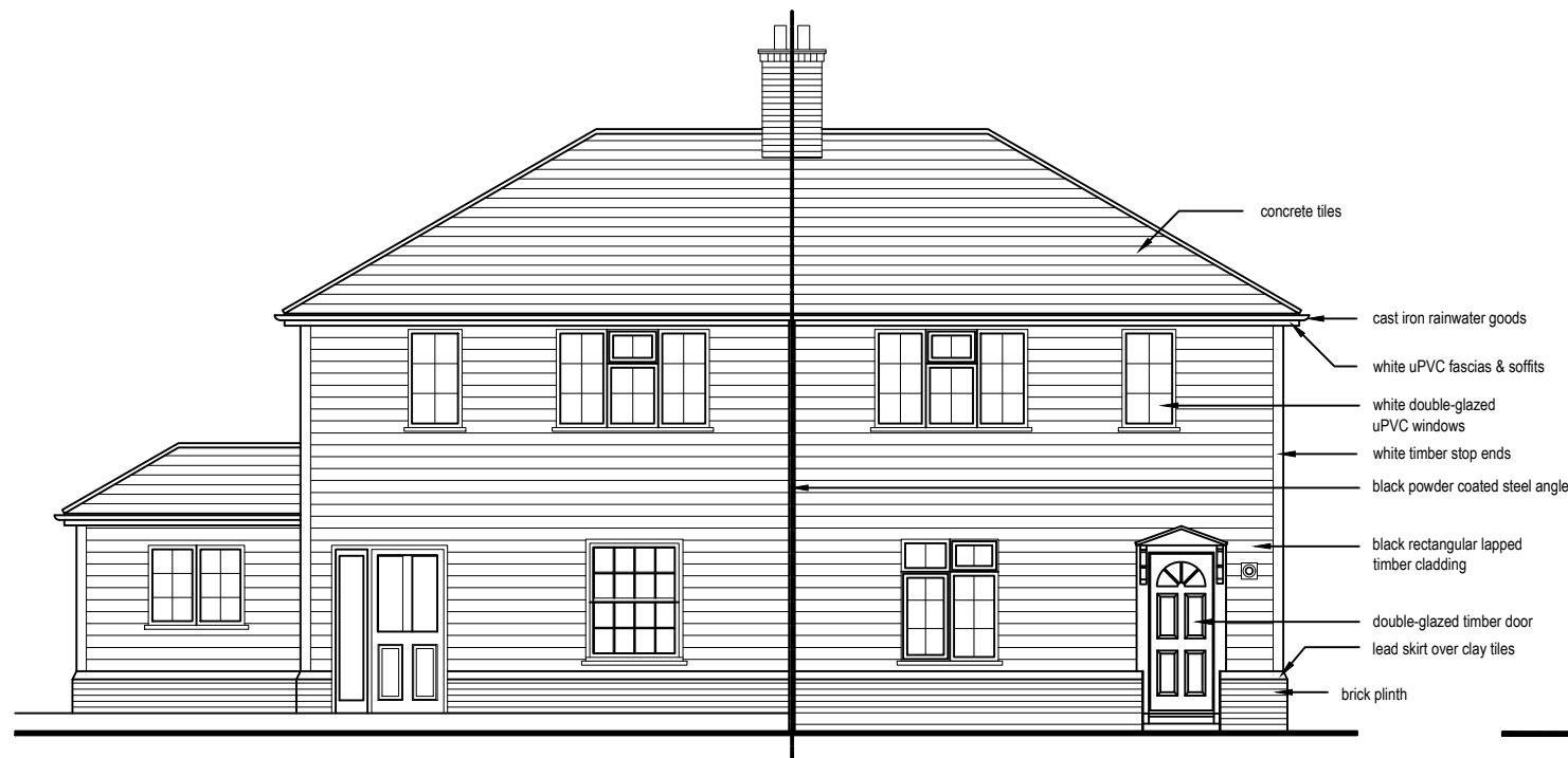
Existing Front Elevation (South West)