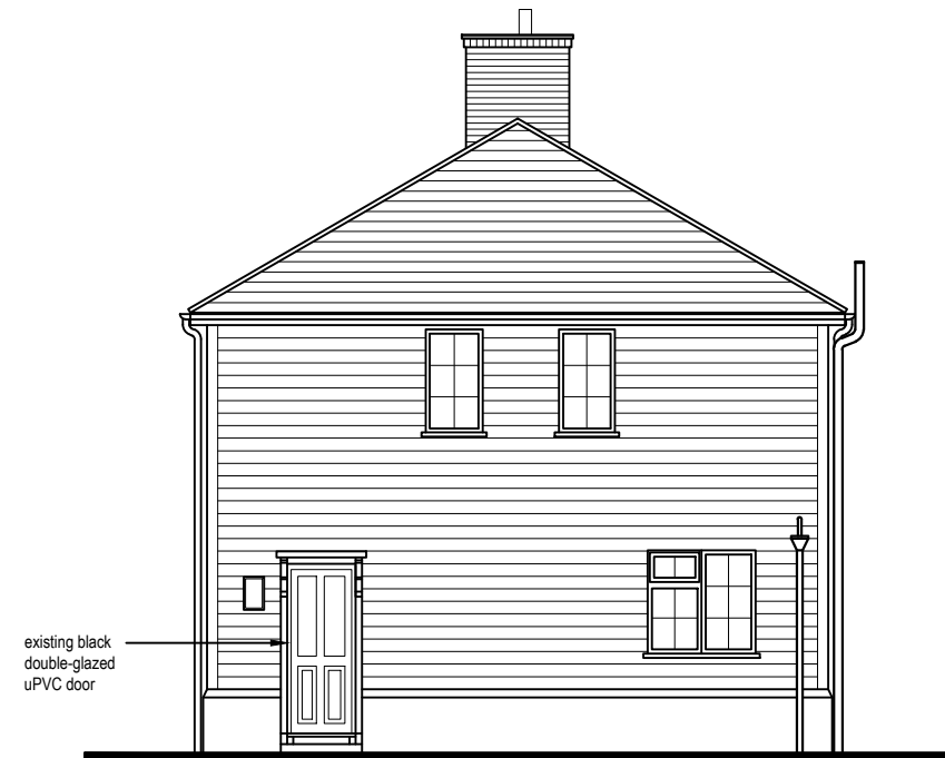
Proposed Side Elevation (North West)