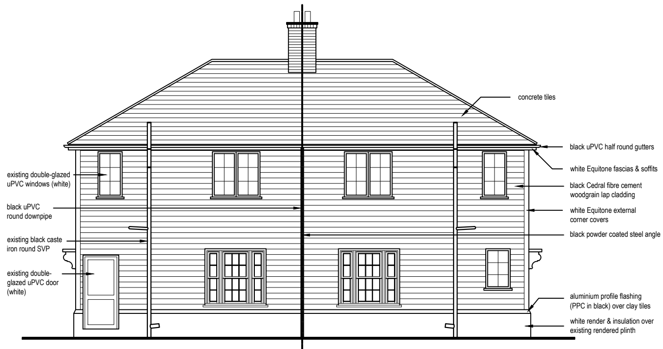
Proposed Rear Elevation (South West)