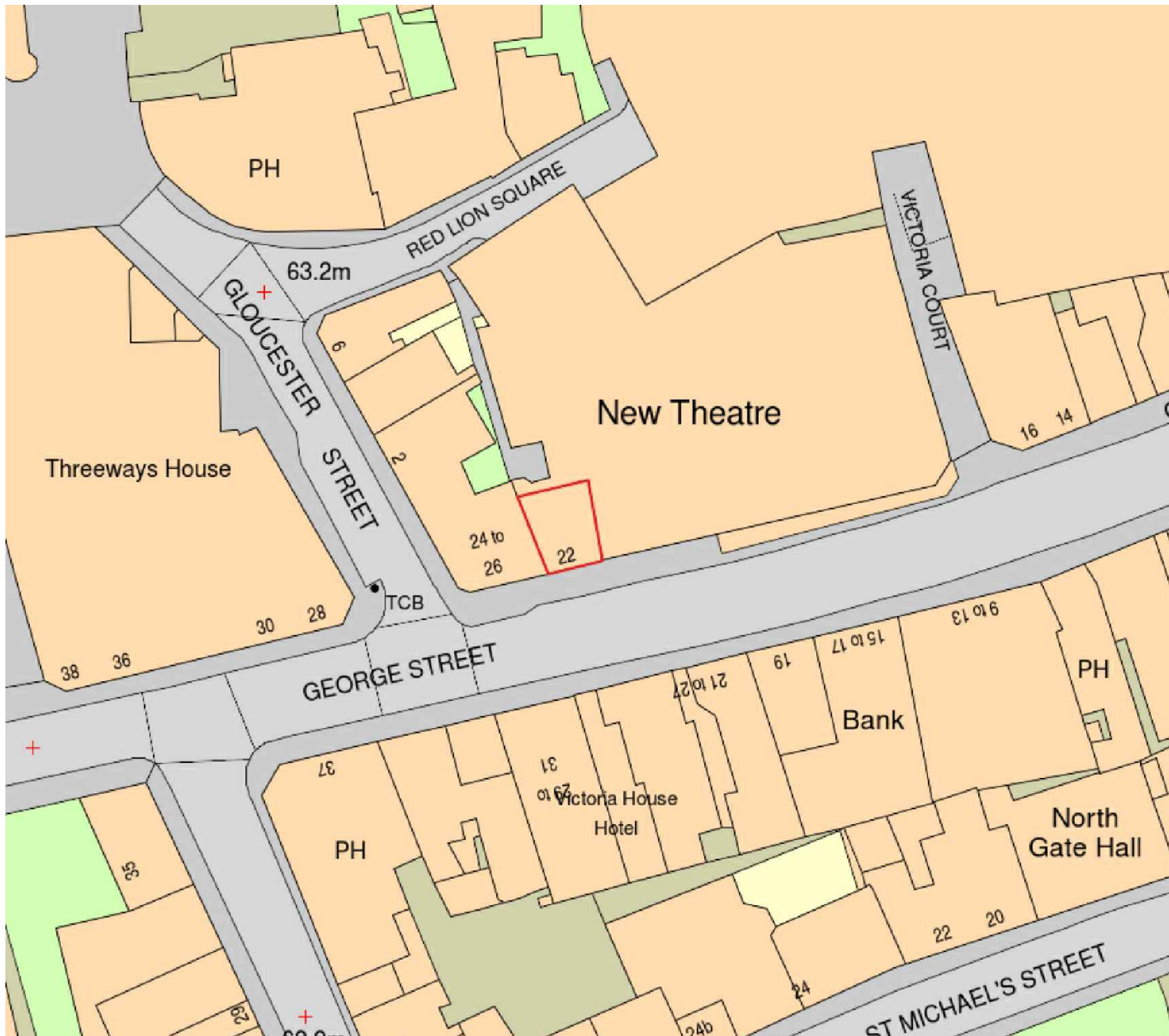
SCALE 1:500 @ A3