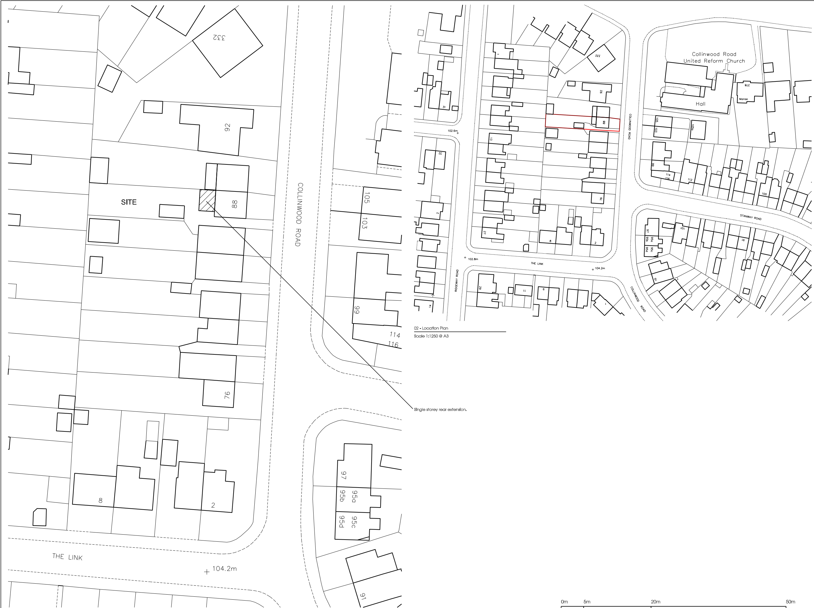
01 - Block Plan Scale 1:500 @ A3