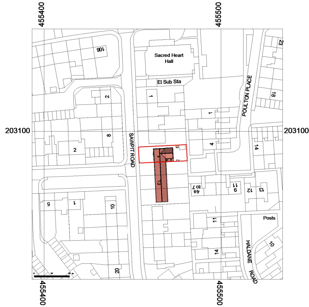
LP LOCATION PLAN SCALE 1 : 1250