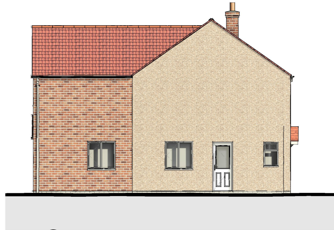
RS EX RIGHTSIDE ELEVATION SCALE 1 : 100