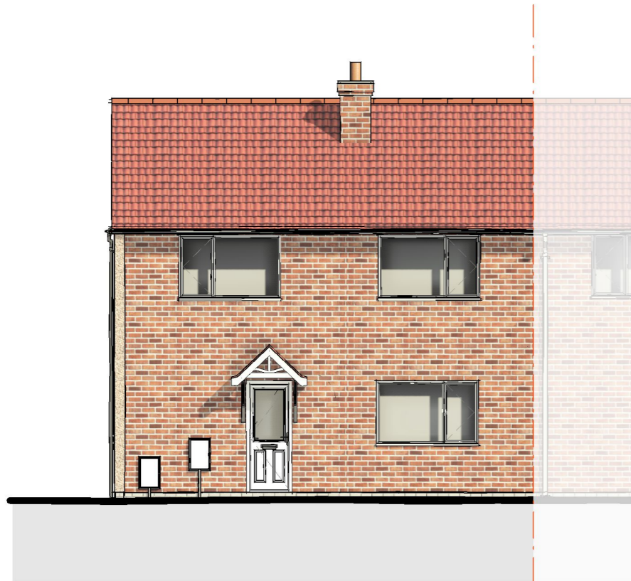
FE EX FRONT ELEVATION SCALE 1 : 100