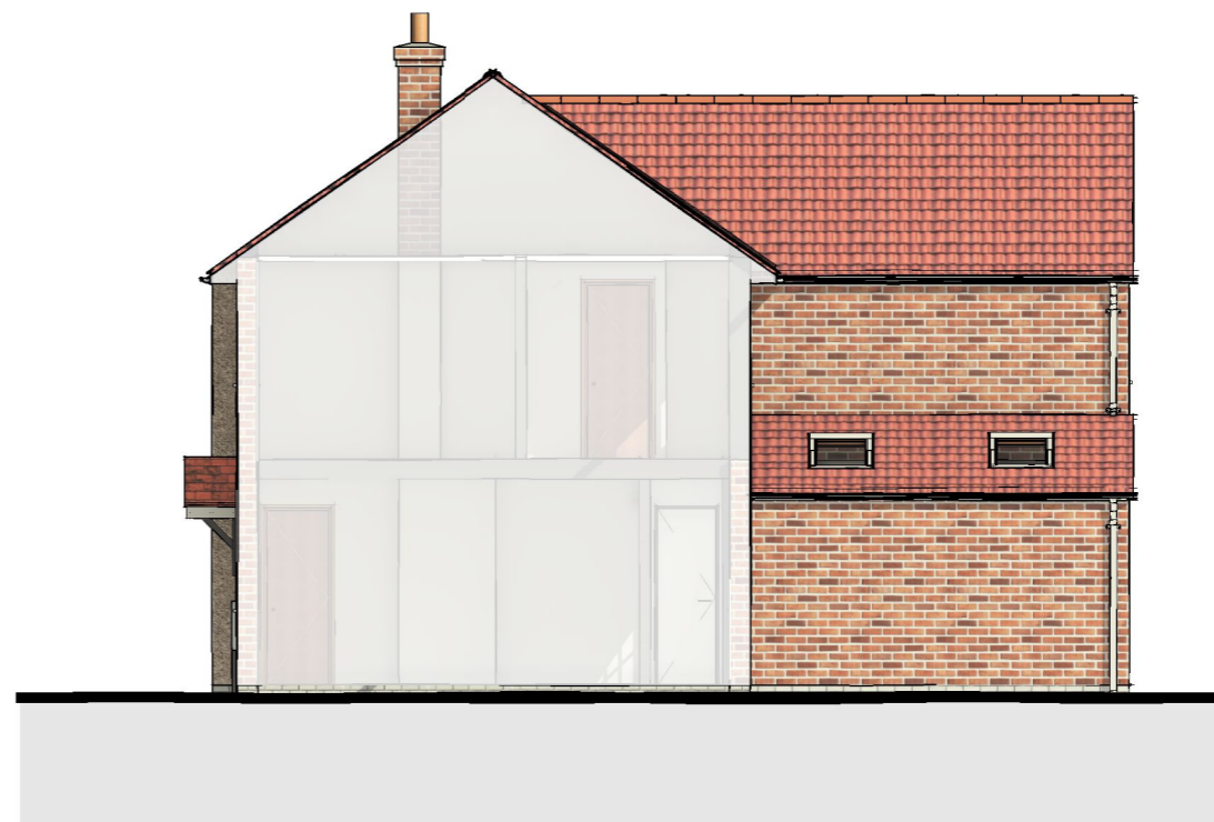
LS EX LEFTSIDE ELEVATION SCALE 1 : 100