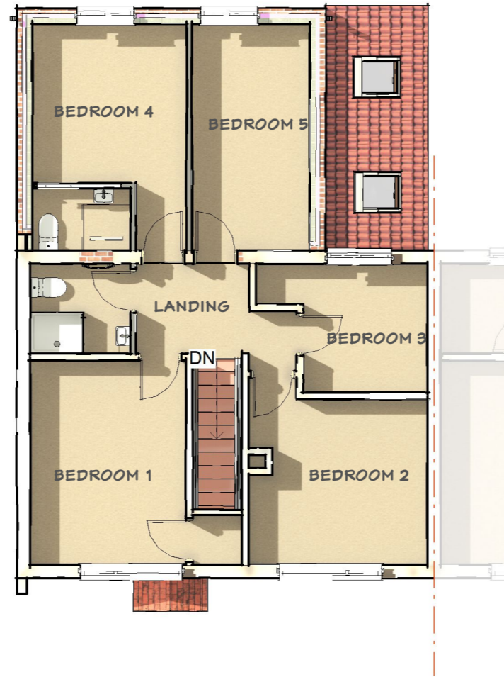
FF EX. FIRST FLOOR SCALE 1 : 100