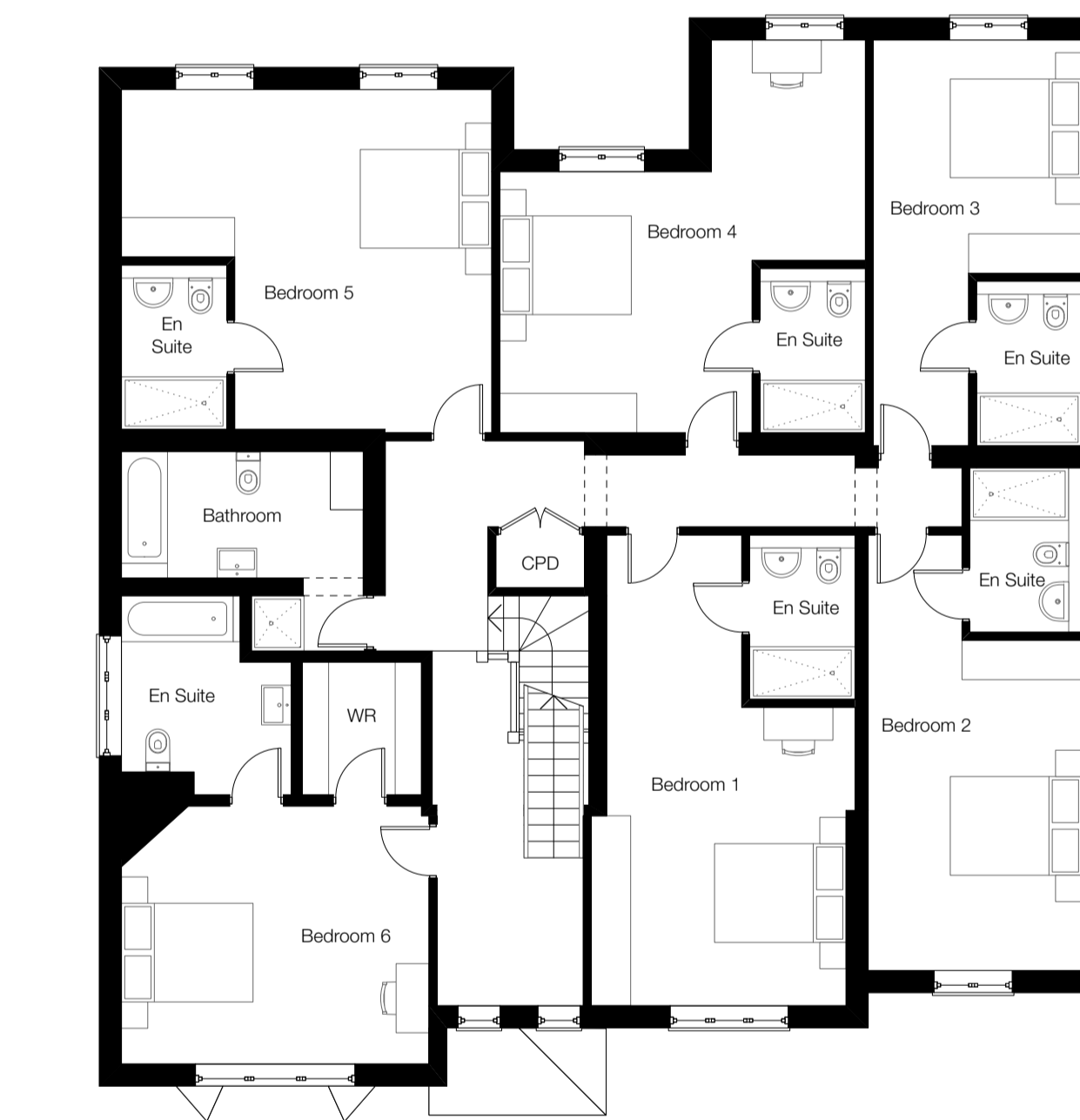
Proposed First Floor Plan Scale 1:100