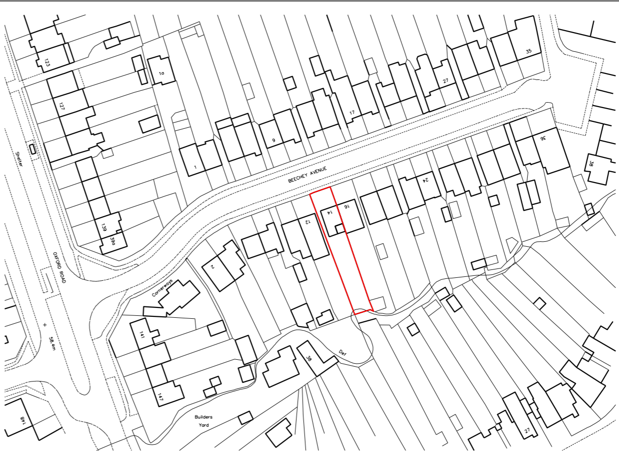
D2 - Location Plan Scale 1:1250 @ A3

First floor extension above. Rear extension.