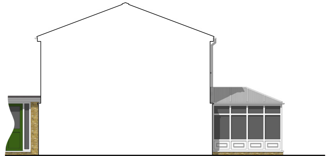
02. EXISTING SIDE ELEVATION (SOUTH EAST)