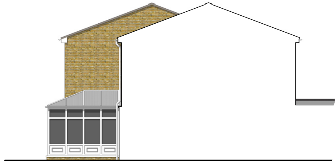
03. EXISTING SIDE ELEVATION (NORTH WEST)