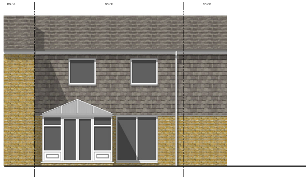
01. EXISTING REAR ELEVATION (NORTH EAST)