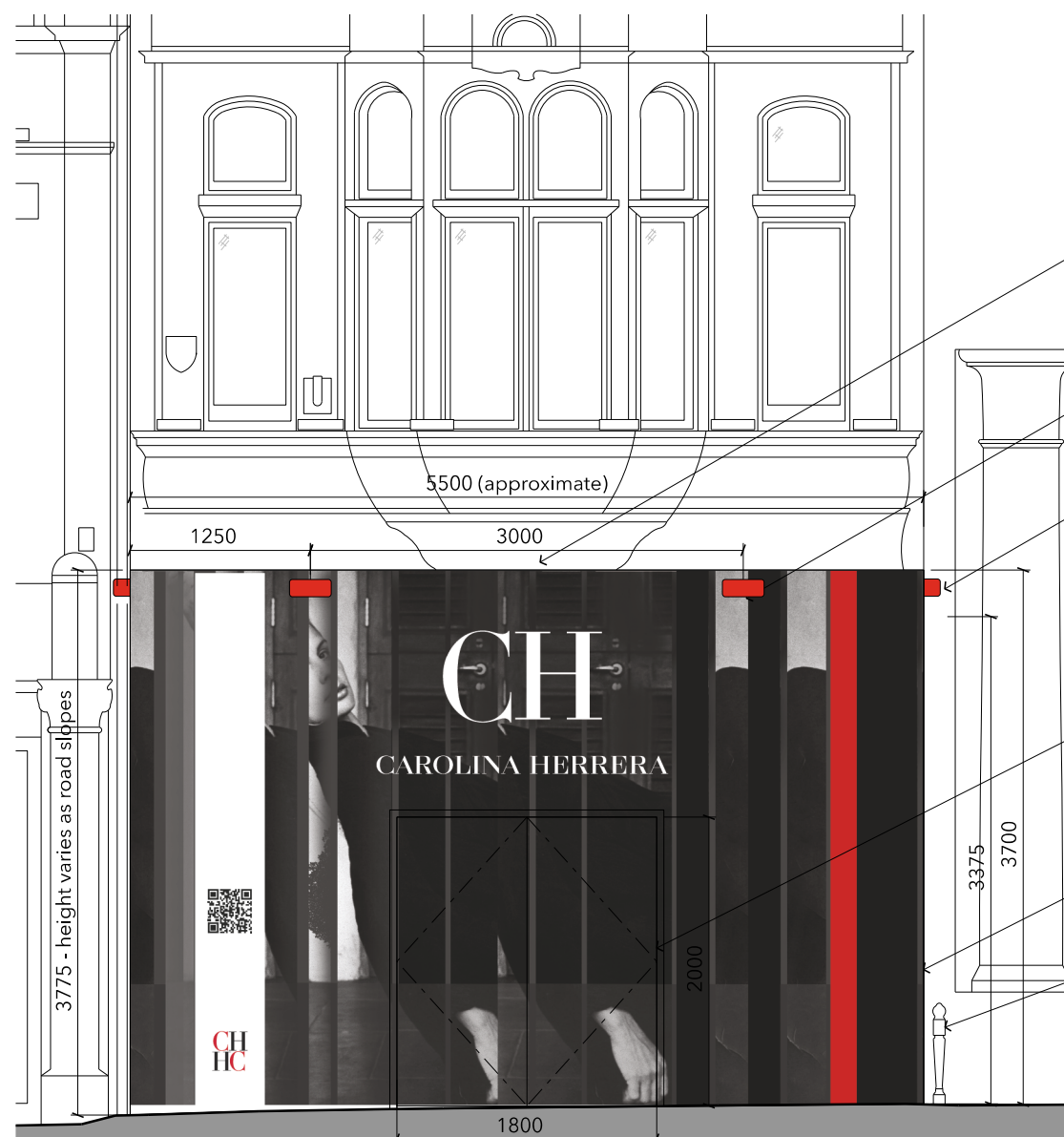
02: Proposed Site Hoarding - Front Elevation SCALE 1:50 @ A3