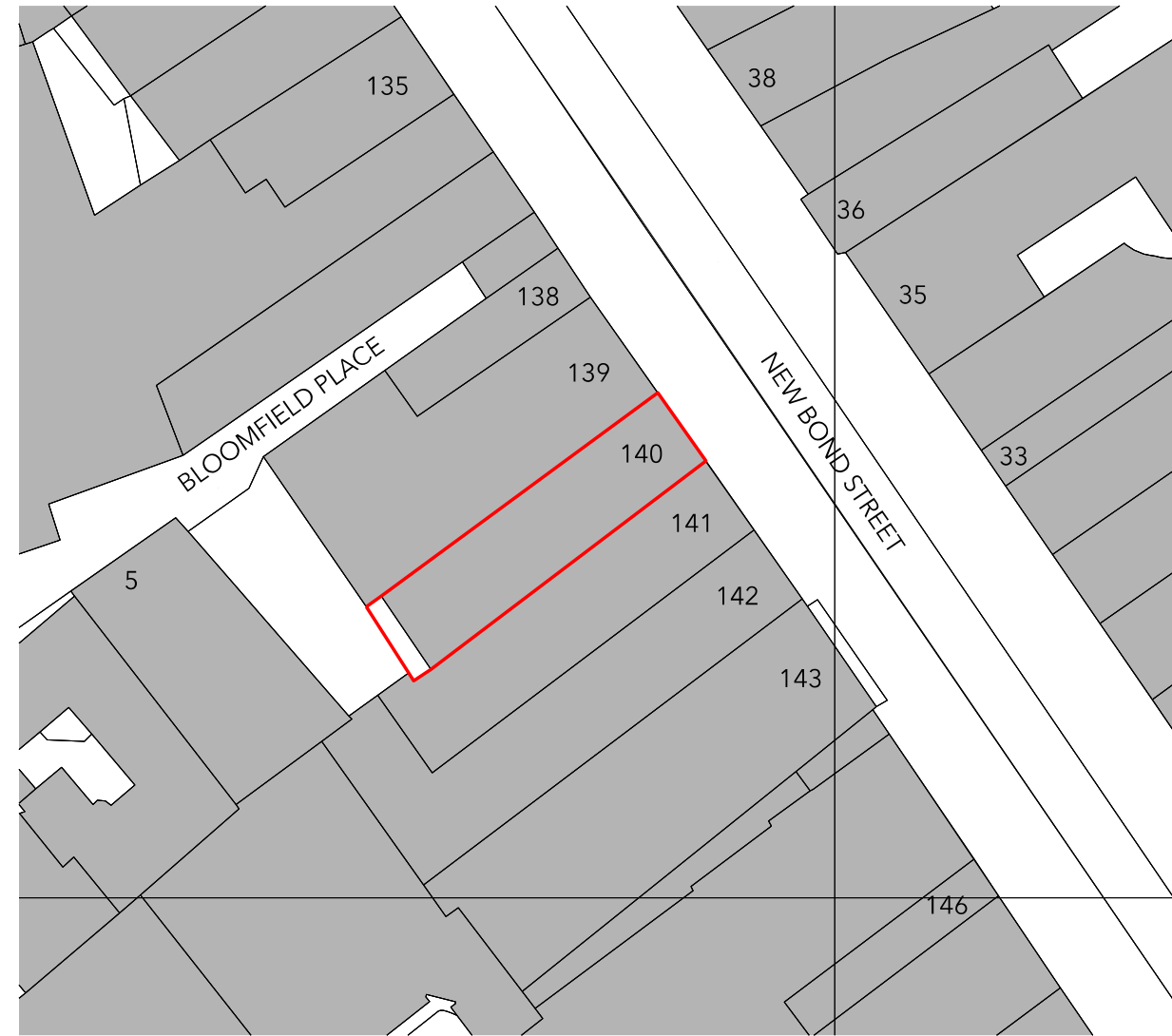
02: SITE PLAN SCALE 1:500 @ A3