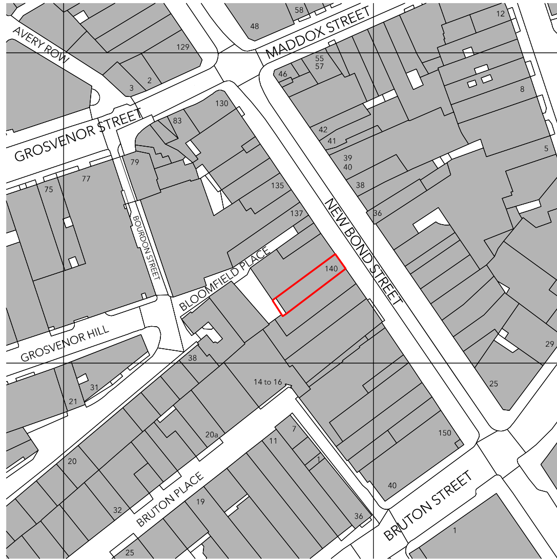
01: SITE LOCATION PLAN SCALE 1:1250 @ A3