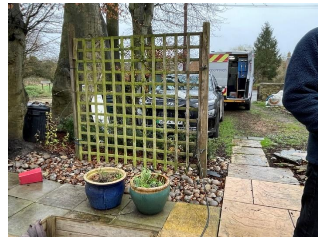
Existing hard standing