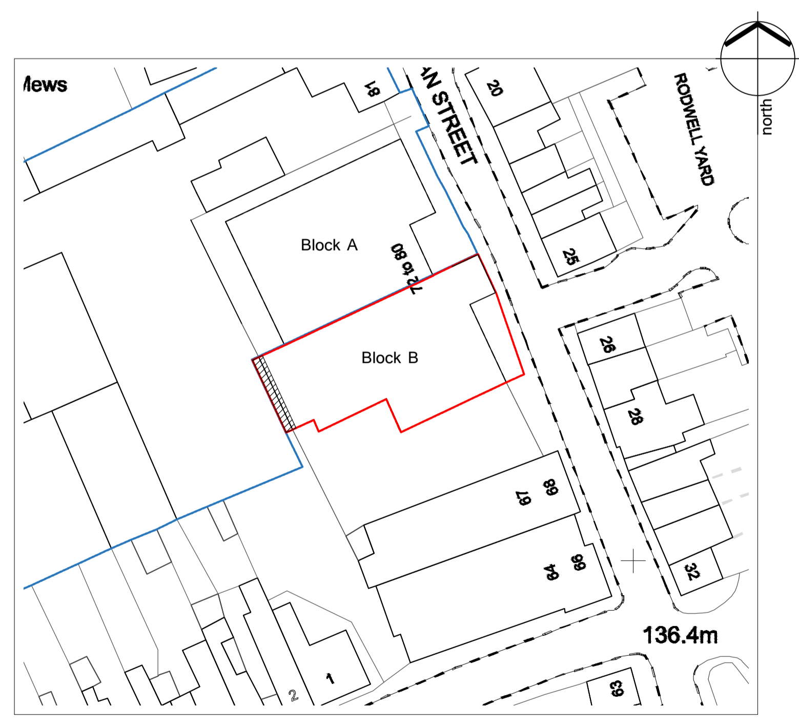
Block Plan area of development 1:500