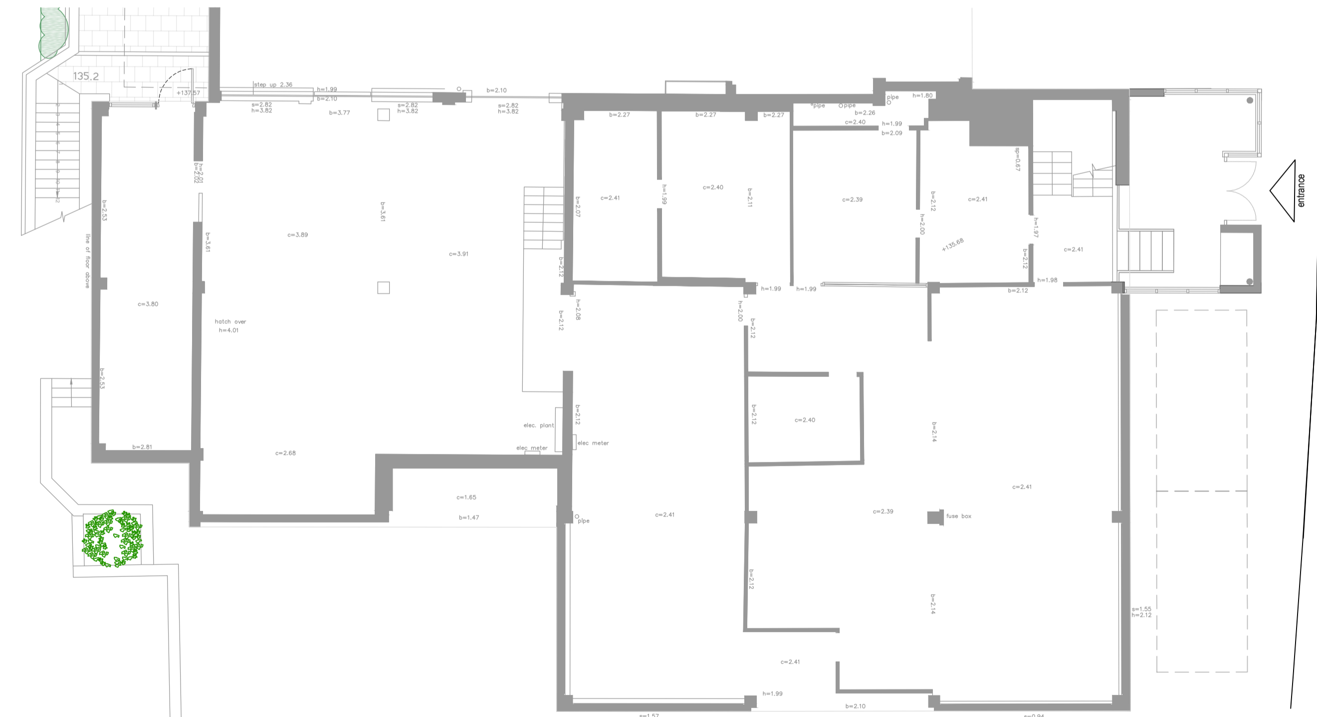
Existing Ground Floor Plan no change 1:100

2500 2450 2400 2350 2300 2250 2200 2150 2100 2050 2000 1950 1900 1850 1800 1750 1700 1650 1600 1550 1500 1450 1400 1350 1300 1250 1200 1150 1100 1050 1000 950 900 850 800 750 700 650 600 550 500 450 400 350 300 250 200 150 100 50 0