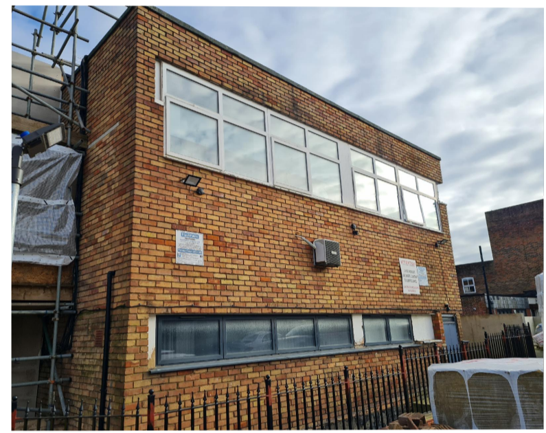
Photograph rear elevation