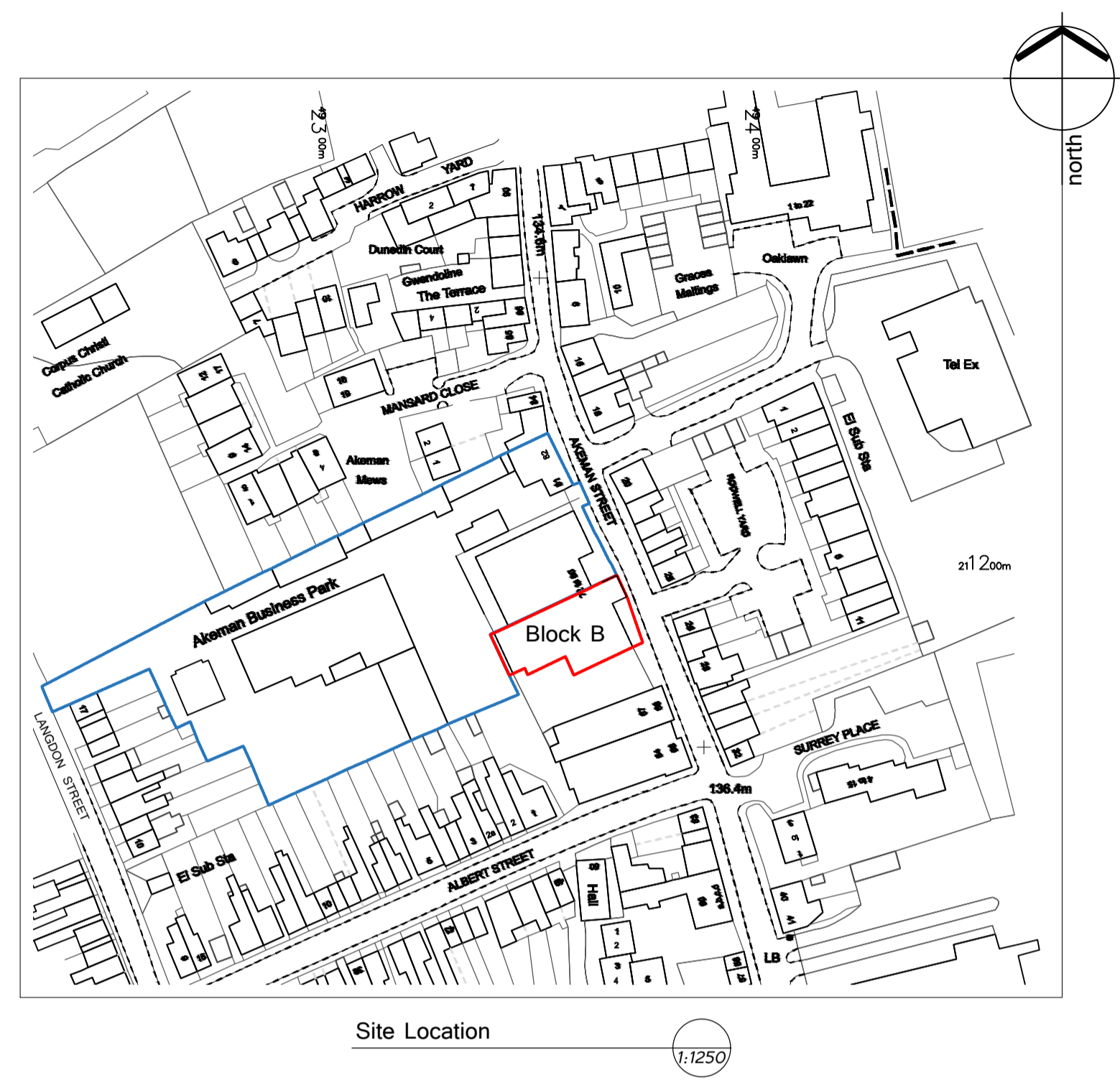
Site Location 1:1250