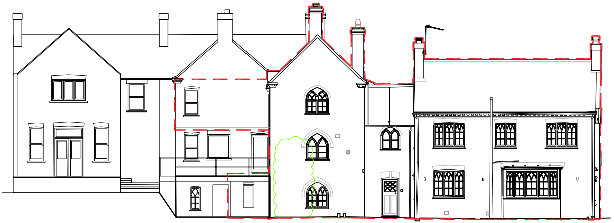
1 EAST ELEVATION - AS EXISTING