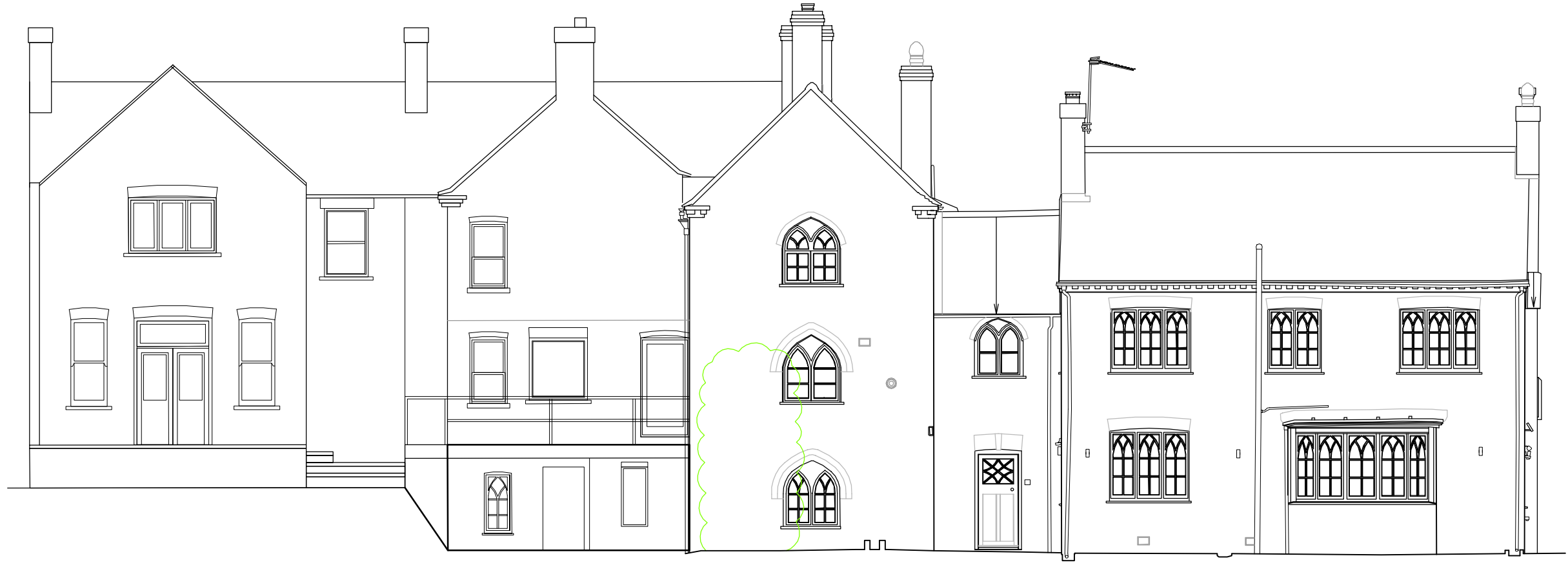
2 EAST ELEVATION - AS EXISTING