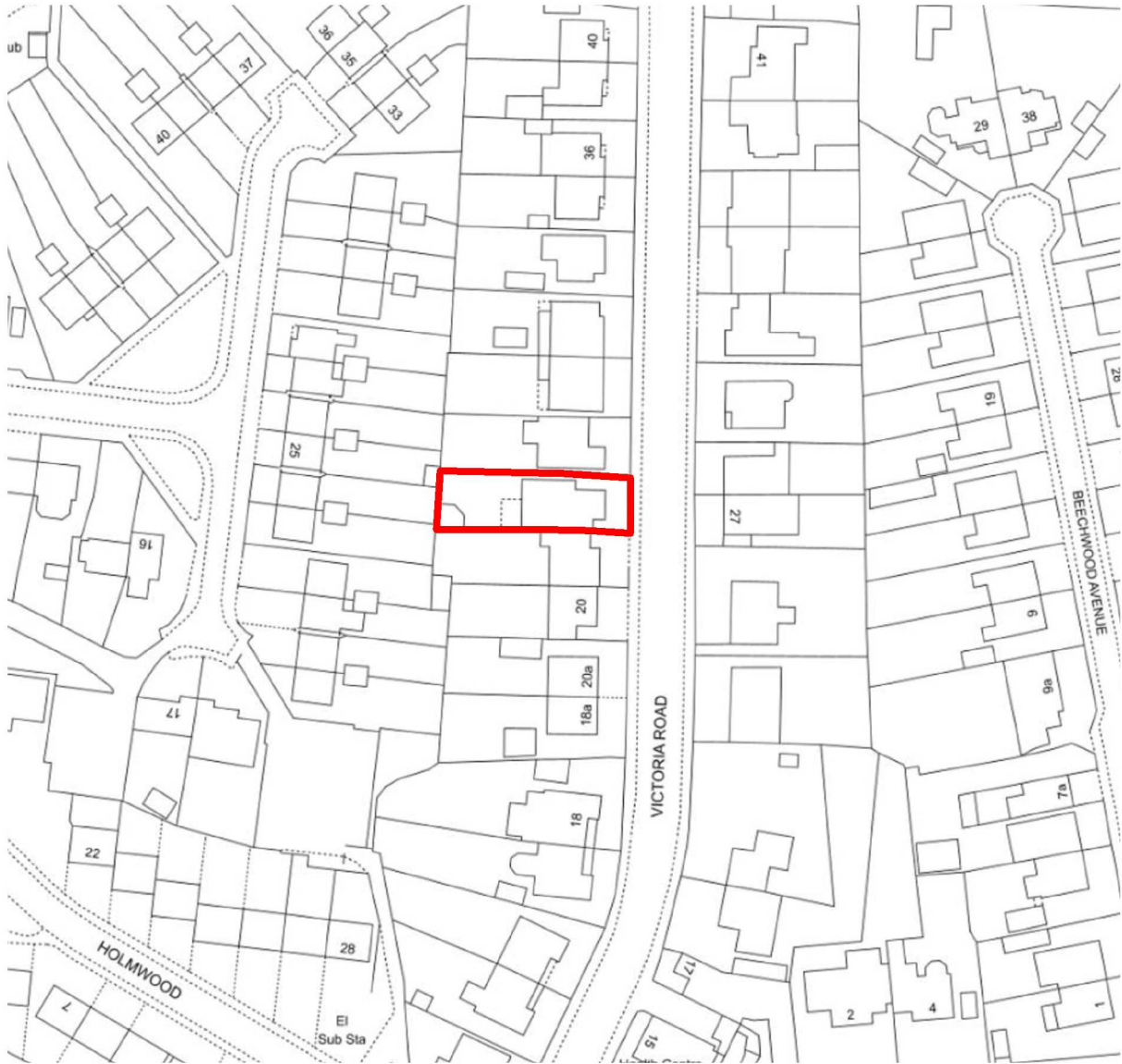
Site Plan 1 : 1250