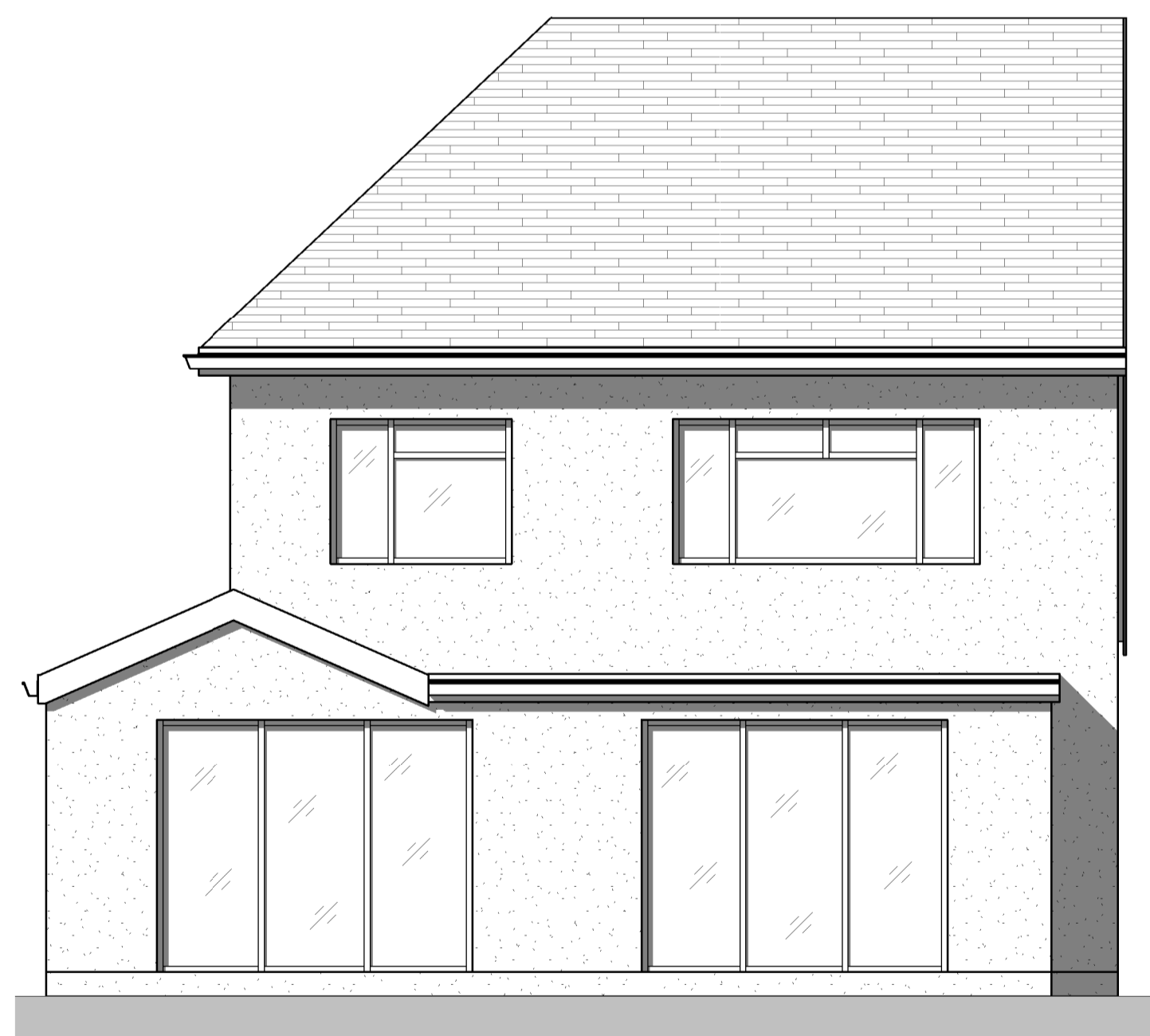
Existing Rear Elevation 1:50