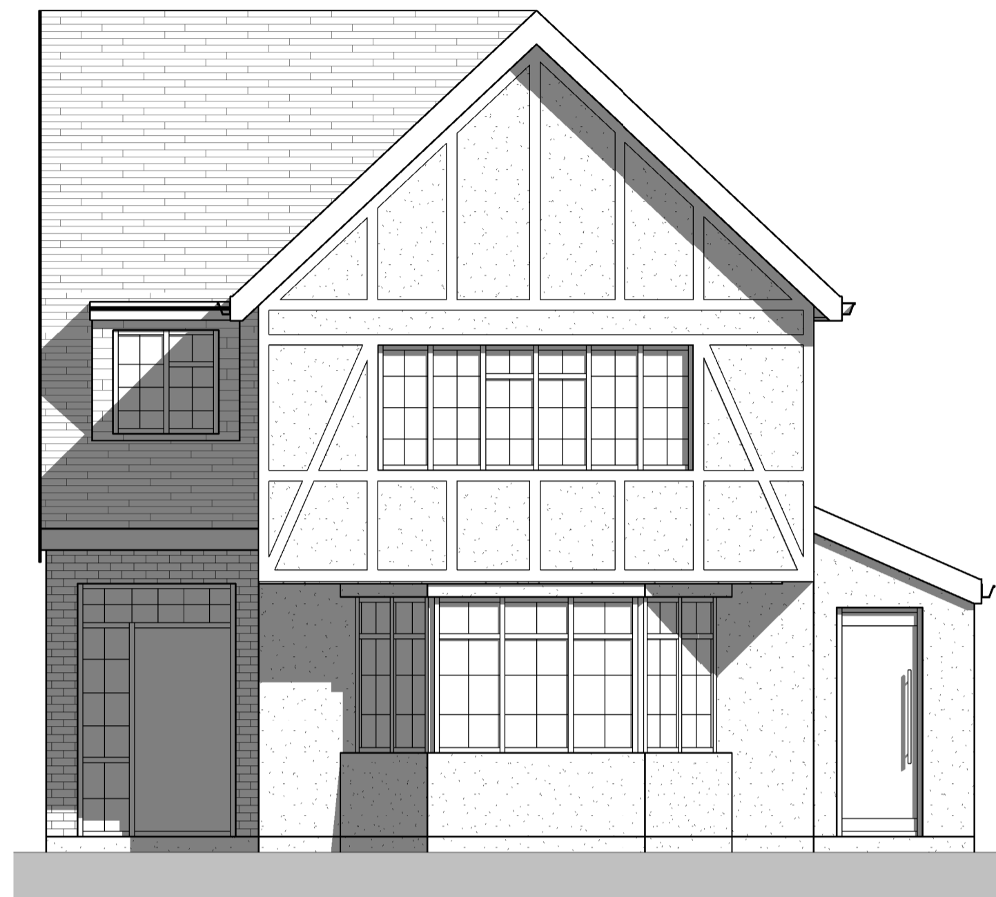
Existing Front Elevation 1:50