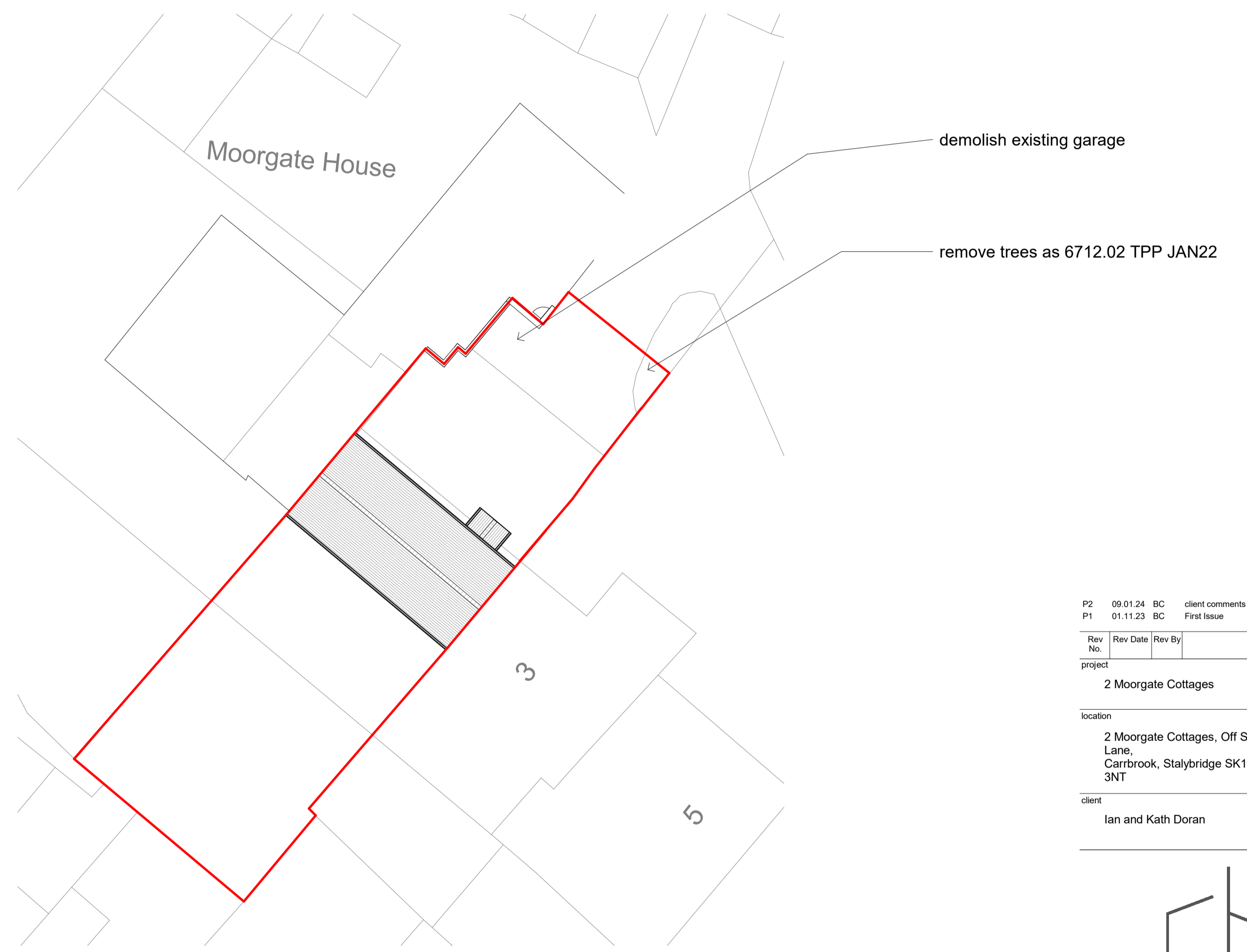
2 Proposed Block Plan 1 : 200