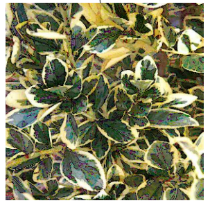
Proposed new planting: Euonymus Japonicas Bravo