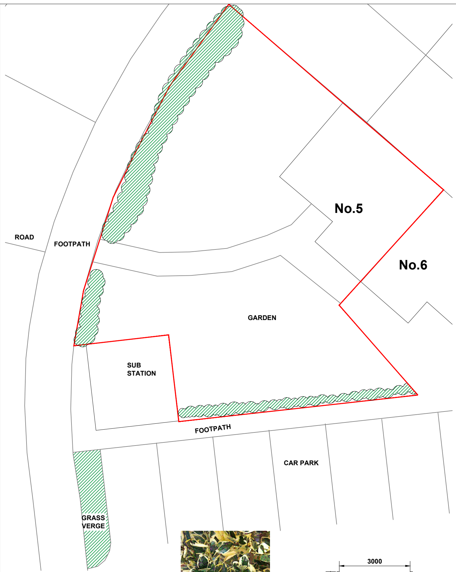
Existing Layout Plan 1:100