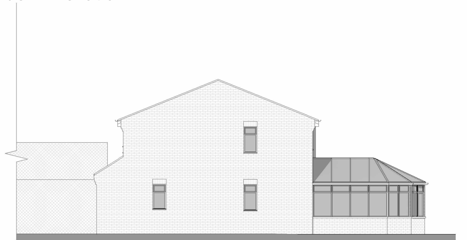
Side 2 Elevation