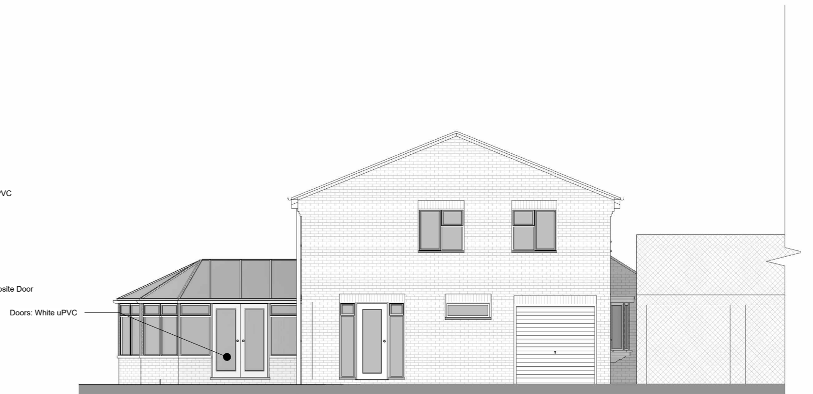
Side 1 Elevation