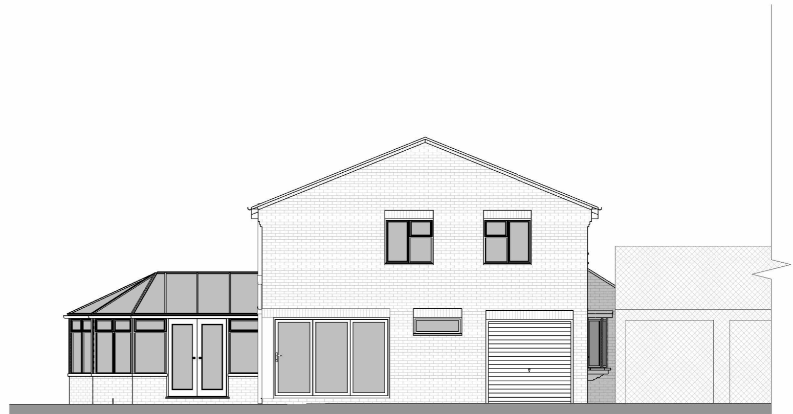
Side 1 Elevation