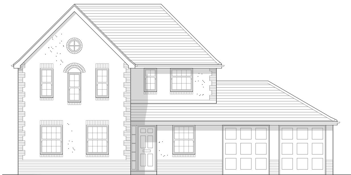
Front Elevation 1:100