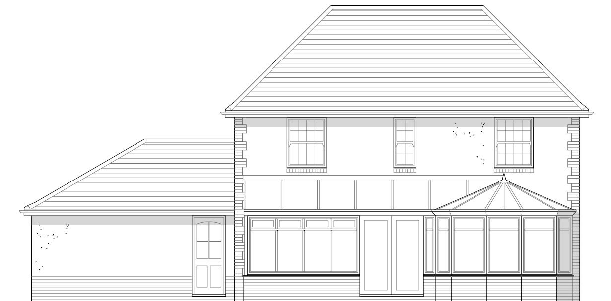
Rear Elevation 1:100