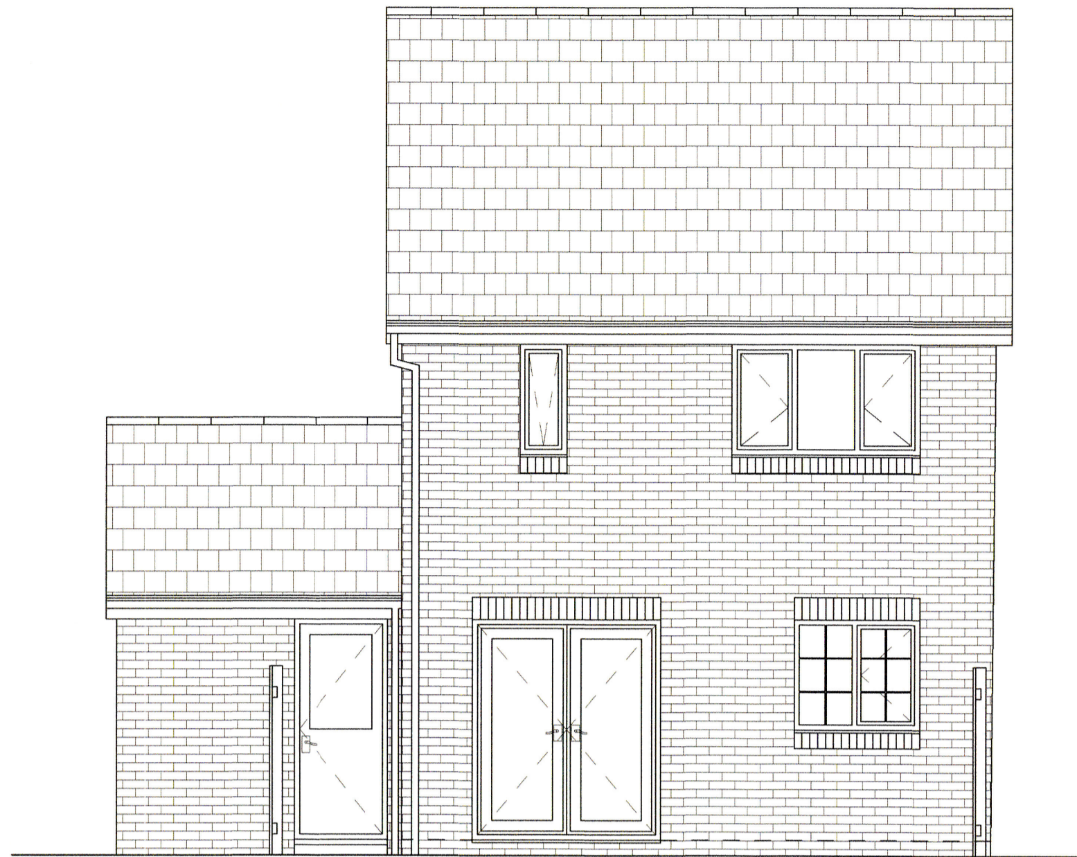
EXISTING EAST ELEVATION 1 : 50