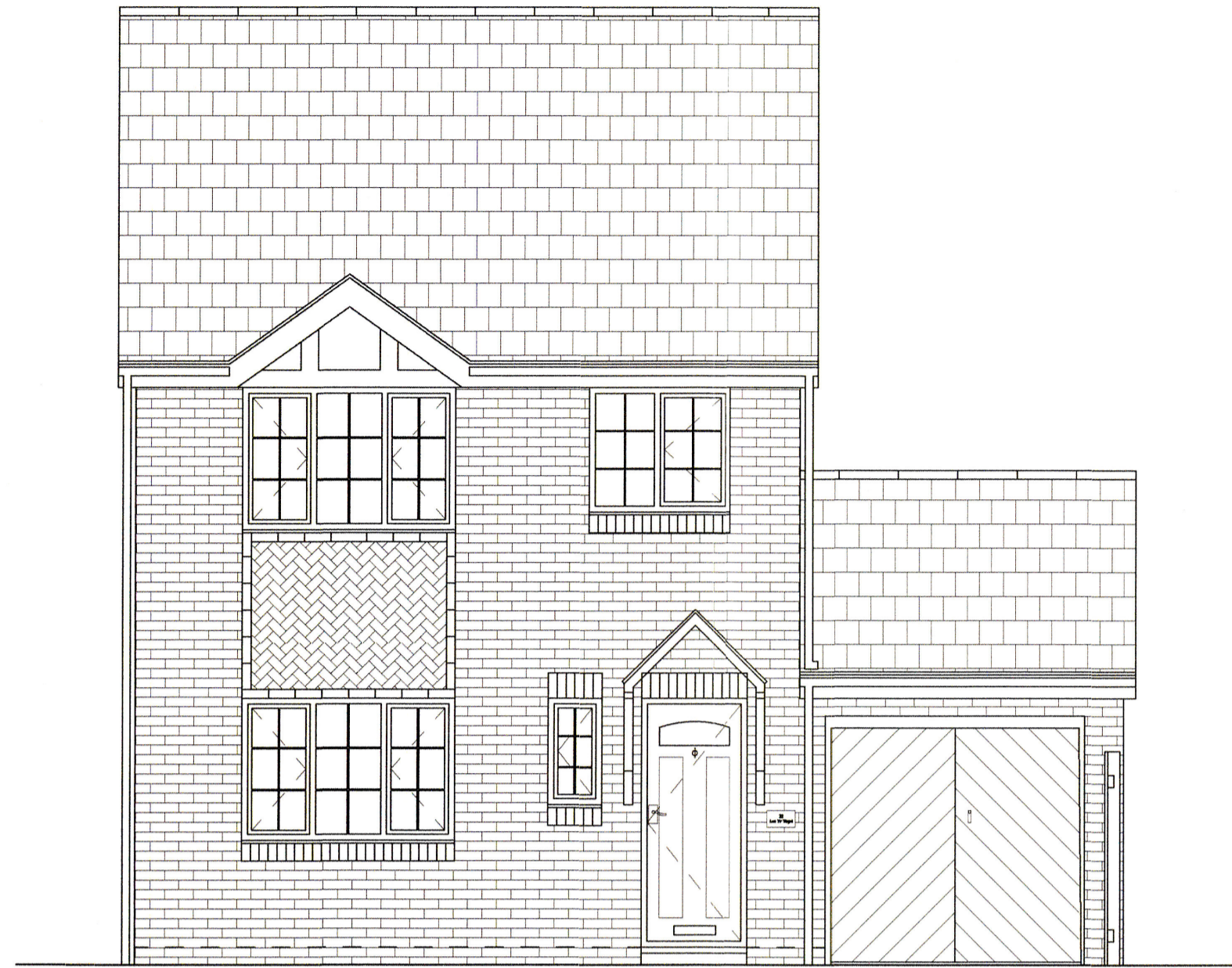
EXISTING WEST ELEVATION 1 : 50