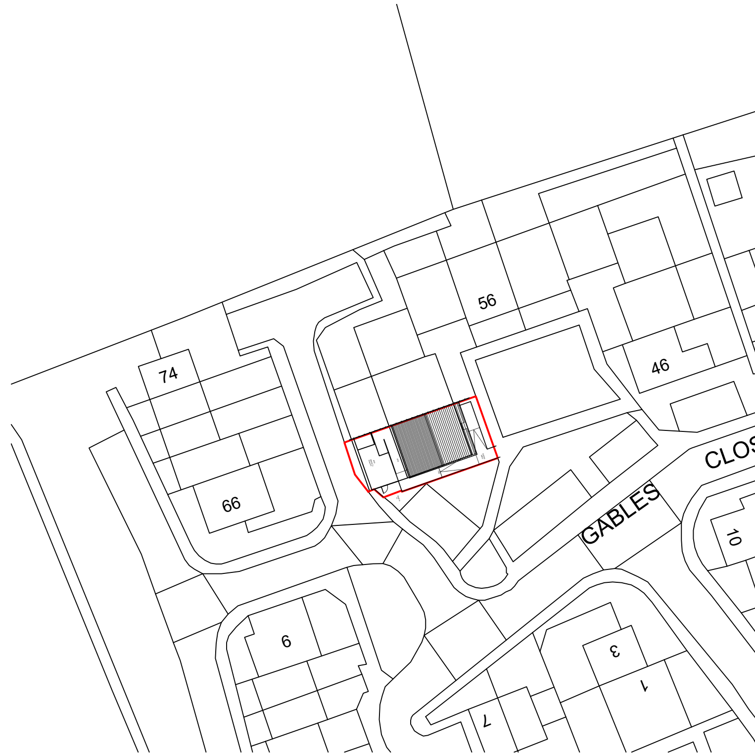
1:500 Proposed Site Plan