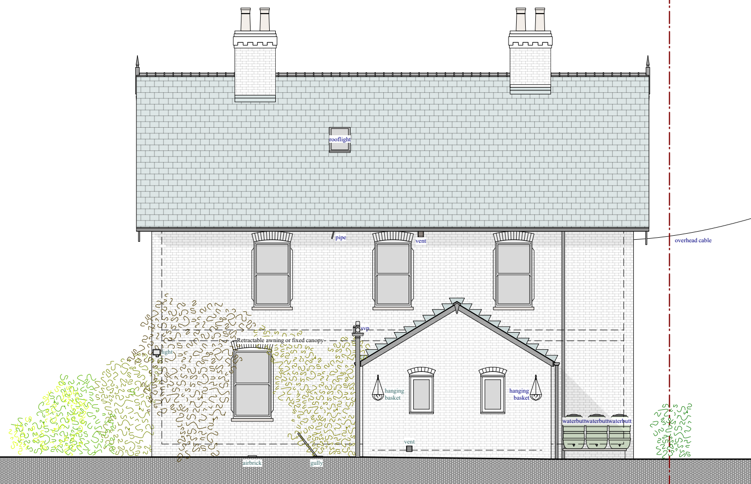
2. REAR (EAST) ELEVATION