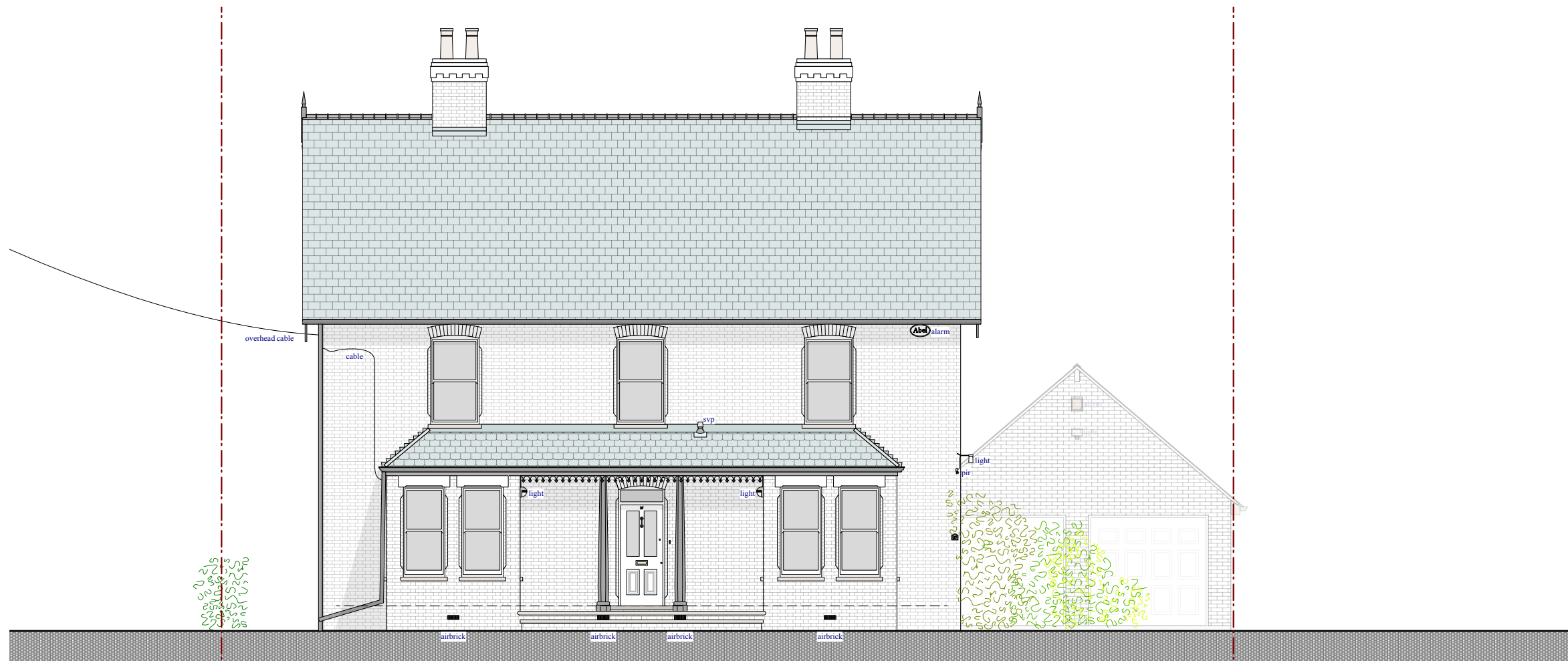
1. FRONT (WEST) ELEVATION