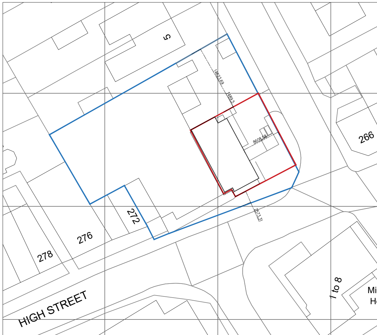
Site Plan as proposed, 1:500

The Copyright of this drawing belongs to Majcher Architect and shall not be used or reproduced in any form without its express permission. The moral right of the author is hereby asserted.