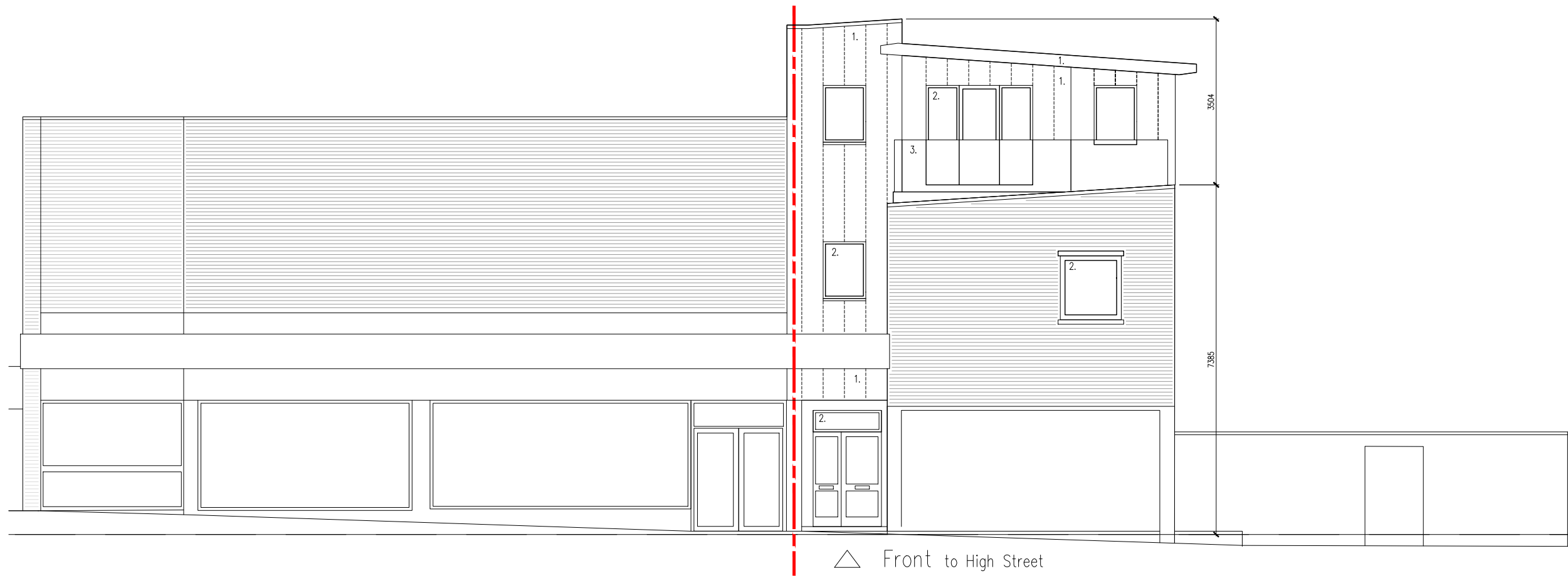
△ Front to High Street