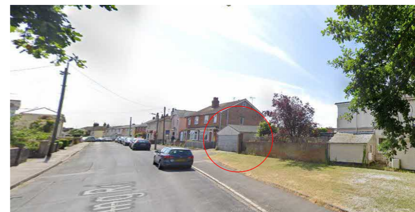
existing view of delapidated garage on spring road rear of 70 ladysmith avenue