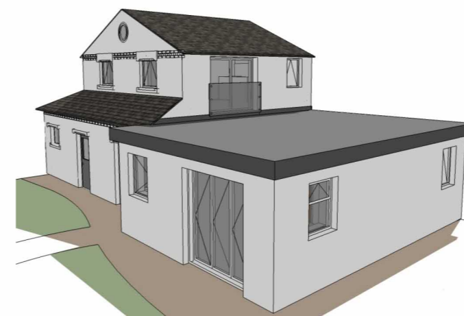
south and west facing view