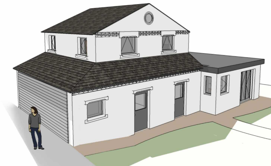
north and west facing view