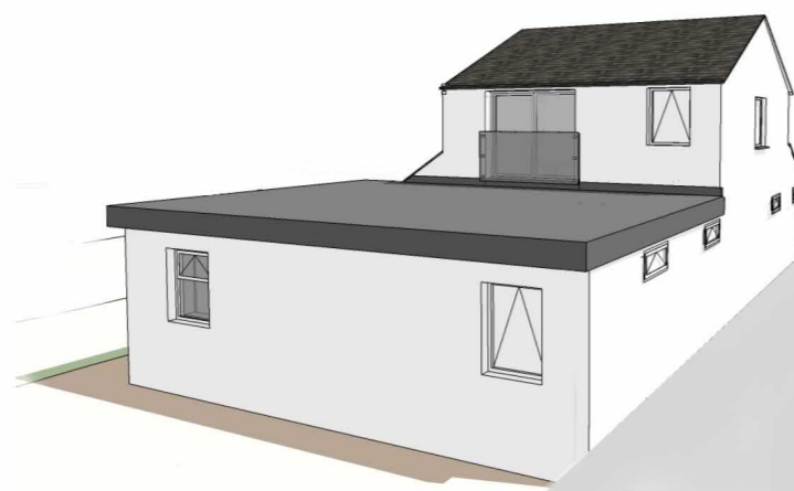
south and east facing view