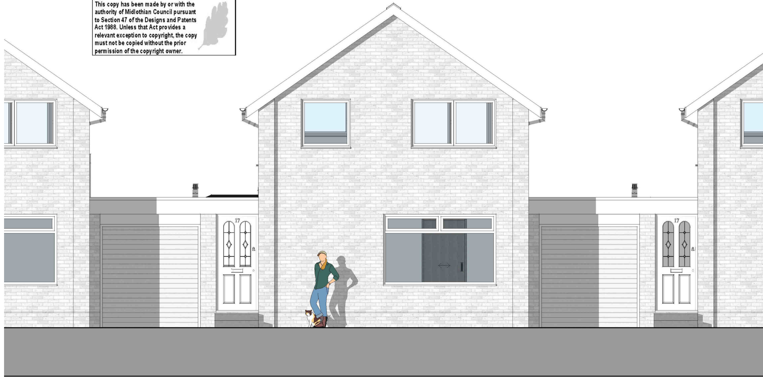
P :: PROPOSED FRONT ELEVATION no changes 7 scale: 1:50

This copy has been made by or with the authority of Midlothian Council pursuant to Section 47 of the Designs and Patents Act 1988. Unless that Act provides a relevant exception to copyright, the copy must not be copied without the prior permission of the copyright owner.