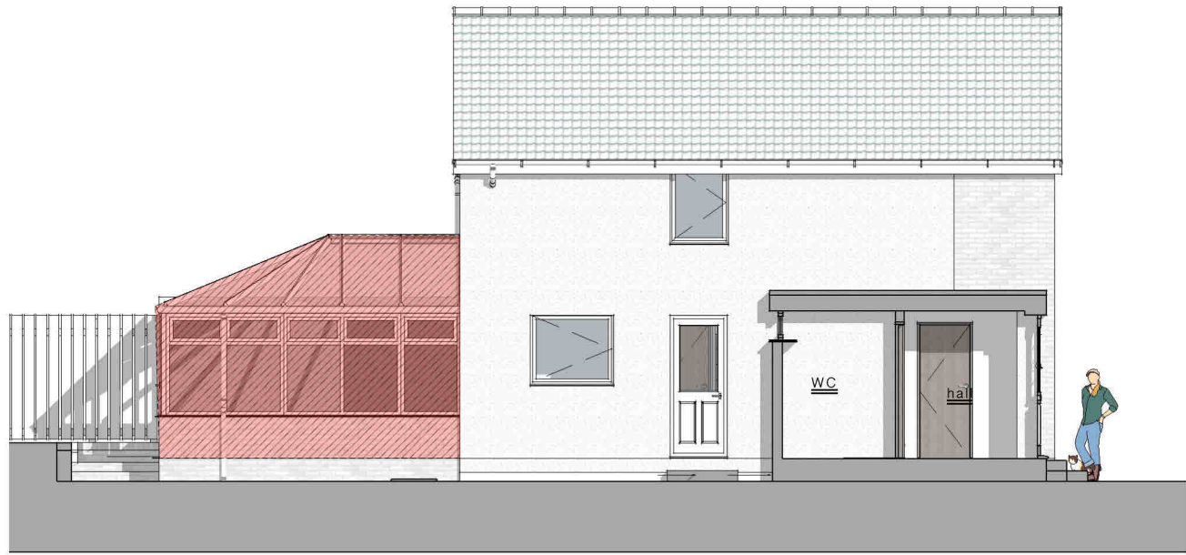
E :: EXISTING SIDE ELEVATION 2 scale: 1:100