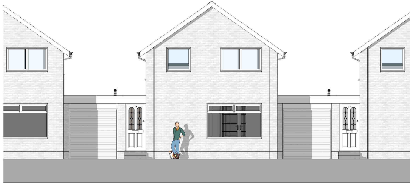
E :: EXISTING FRONT ELEVATION 1 scale: 1:100