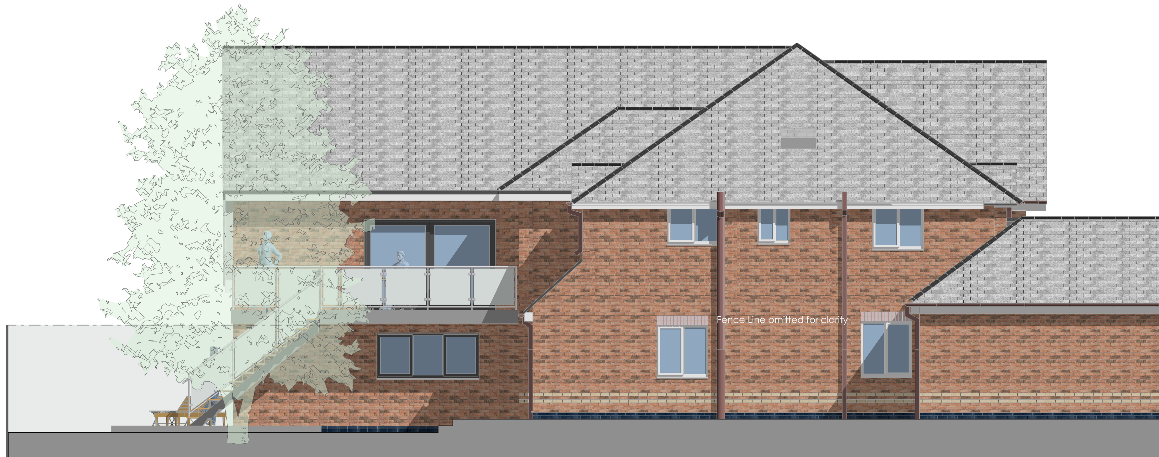
Side Elevation 2